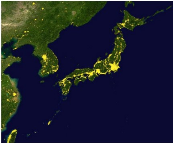
Fig. 3. Nighttime satellite image of Japan's lights superimposed on a daylight satellite image of the archipelago and its eastern neighbors.