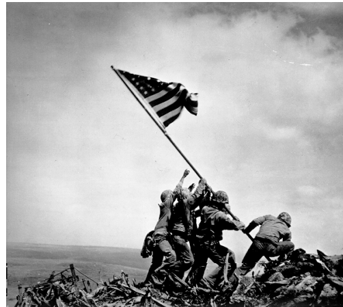
Joe Rosenthal's original photo in Iwo Jima

after the fighting was over, John Wayne himself.[1]