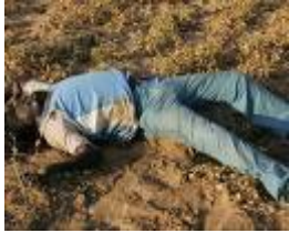
Victim of Darfur

great Josef von Sternberg, have tried. To my mind, Clint Eastwood is the first to have pulled it off.