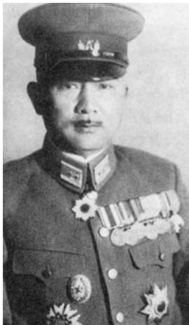
Lt. General Kuribayashi

Unsupported by any sea or air power, they were under orders to fight to the death, hoping against hope that this would deter an invasion of Japan. Lethal but invisible, they spent days and nights in sauna-like conditions, with food and water supplies running out fast, killing as many enemies as they could before, in many cases, blowing themselves up. No wonder the Marines thought of their enemies as rats who had to be burned out of their holes with flamethrowers. Many Americans on Iwo Jima had the words "Rodent Exterminator" stenciled on their helmets.[2]