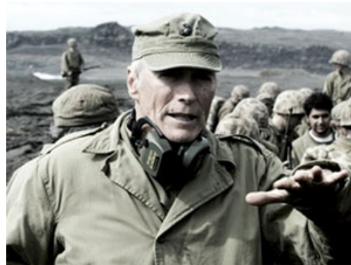
Clint Eastwood on location

A common factor in conventional war movies, whether they are made by Americans, Europeans, or Asians, is the lack of visible enemies. They are there, in the way Indians were there in old westerns, as fodder for the guns on our side, screaming Banzai! or Achtung! or Come on! before falling to the ground in heaps. What is missing, with rare exceptions, is any sense of individual difference, of character, of humanity in the enemy. And even the exceptions tend to fall into familiar types: the bumbling or sinister German, hissing about ways to make you talk, the loud, crass American, the snarling Japanese.