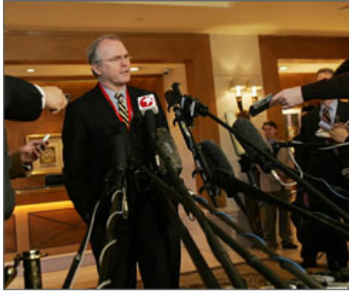
Assistant Secretary of State for East Asian and Pacific Affairs Christopher Hill speaks to journalists at a hotel in Beijing, Feb. 2007.

In February 2007, as the resumption of the 6-party process shows, US policy changed from mostly sticks to more carrots. Why? Is it that North Korea had become more dangerous by acquiring nuclear potential? Although nobody can be sure whether the nuclear device is functional, there is a suspicion that it might be almost worthless from a military point of view. For one thing, it is doubtful that North Koreans have the technology to enable them to make a combat-ready nuclear weapon, although nasty surprises are not impossible. For another, they do not have – and will not have in the immediate future – any means of delivery. But North Koreans actually do not need a nuclear bomb to deter an all-out conflict - their conventional forces and subversive capacities are enough to contain any such attempt - and the Pentagon agreed a decade ago it was not worth it. Nor was there any obvious sense of increased threat on the part of its adversaries after Pyongyang went