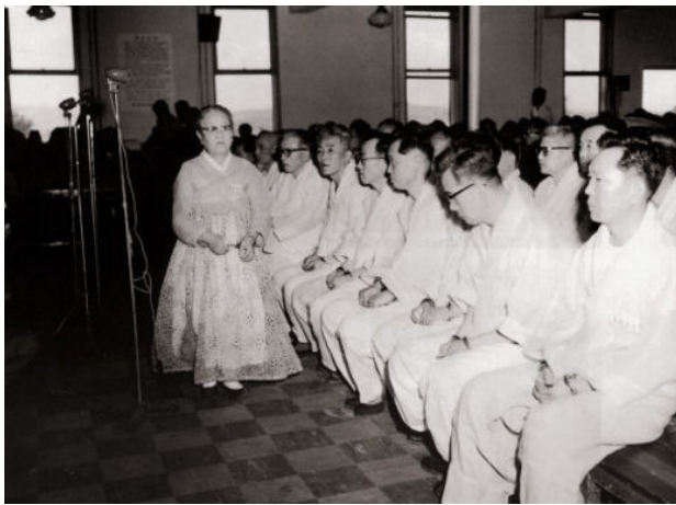
Senior officials of the Minjok Ilbo in court, 1961

Other cases ( http://english.hani.co.kr/popups/print.hani?ksn=186914 ) are expected to be opened shortly, including that of the 1961 execution of Cho Yong-su, President of the Minjok Ilbo newspaper, for violating the National Security Law.