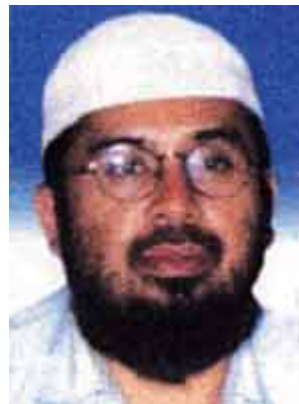
Head of Jamaah Islamiyah

Various incarnations of the group have been involved in rebellions since the mid-20th century. Sekarmadji Maridjan Kartosuwirjo started an indigenous Islamic rebellion on 7 August 1949 - just when Indonesia was gaining independence from Dutch colonial rule. Disappointed with the newly formed Indonesian Republic headed by Soekarno, Kartosuwirjo proclaimed his own Indonesian Islamic State (NII) [3] in opposition to Jakarta's central government. Areas of West Java under NII control were called 'Darul Islam.' An estimated 15,000 to 20,000 people died during the ensuing thirteen-year rebellion, which was finally crushed in 1962. Kartosuwirjo was captured and executed by firing squad. But that was far from the end of DI.