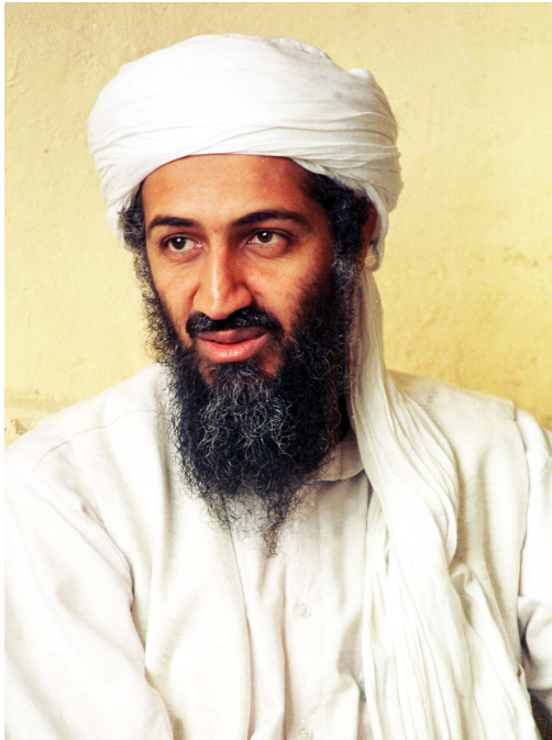
Osama bin Laden

marriage; but rather a way of understanding and constructing the world, replete with implications for the evolution and organisation of political life (Lindholm, 1986: 334).