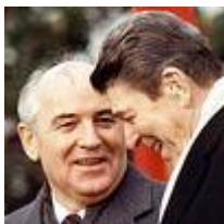
Reagan and Gorbachev

The last Soviet leader, Mikhail Gorbachev, came to power in 1985 with heretical "New Thinking" that proposed not merely to ease but to actually abolish the decades-long cold war. His proposals triggered a fateful struggle in Washington (and Moscow) between policy-makers who wanted to seize the historic opportunity and those who did not. President Ronald Reagan decided to meet Gorbachev at least part of the way, as did his successor, the first President George Bush. As a result, in December 1989, at a historic summit meeting at Malta, Gorbachev and Bush declared the cold war over. (That extraordinary agreement evidently has been forgotten; thus we have the New York Times recently asserting that the US-Russian relationship today "is far better than it was 15 years ago.")