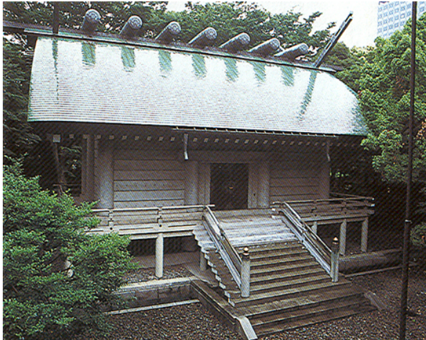
The Repository

sanctuary at Yasukuni, there are files, presently being digitalized, containing personal details. The latest shrine figures for the dead are as follows: the Manchurian 'incident' 17,176, the China war 191,250, and the Pacific war 2,133,915. I say 'the latest figures' because those for the Pacific war change. Last year, the shrine enshrined 12 new kami. Families of the war dead inquired of the shrine whether their fathers, brothers or uncles were venerated at Yasukuni; the shrine carried out checks and discovered that these names were not in the archive. The dead were duly transformed into kami through a rite of apotheosis. [2]