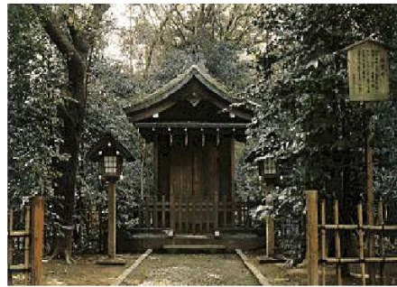
The Spirit Pacifying Shrine

construction of the fence, as explained to this author, was that the chief priest at Yasukuni had received intelligence that unknown persons were planning to blow the Chinreisha up. It is clear, however, that the very existence of the Chinreisha is a matter of great controversy within the Yasukuni priesthood. Why would anyone want to blow it up; what makes it controversial?