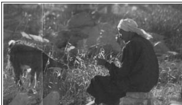
An old man was feeding green grass to goats by the side of a huge crater that had gathered water, having probably been created by a bunker buster.

When the high-speed uranium metal projectile hits the armor of a tank, the impact creates extreme heat, melting the armor, setting the inside of the tank on fire and incinerating those inside. Uranium dust consisting of minute particles a few microns in size is diffused into the air. When breathed in it settles in the lungs, causing serious radiation damage. This radioactive oxide material is carried on the wind, which means that ordinary people kilometers away from the war zone could breathe it in.