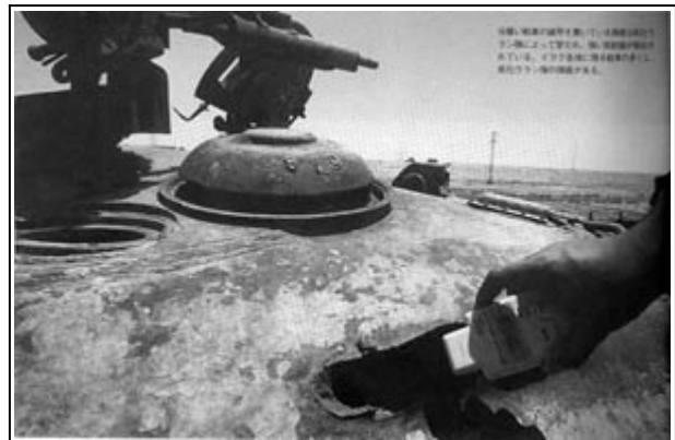
The bullet holes that pierced the armor of these tanks were caused by depleted uranium shells and strong radiation is observed.

Depleted uranium (DU) is not the only radioactive contamination decaying Iraq. A large tank looted from the Nuclear Energy Research Center in Tuwaitha, a suburb of Baghdad, was abandoned in a vacant lot of a residential area. There the yellow cake (uranium concentrate) of the nuclear fuel is exposed to the air, while geese drink the muddy water in the area and sheep graze.