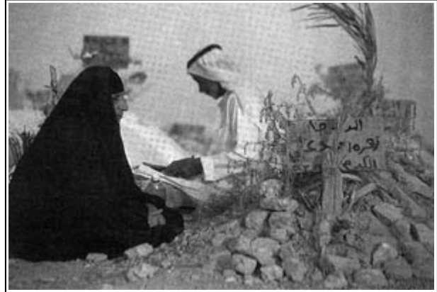
As if to surround a children's graveyard in central Basra city, I saw grave markers of citizens who became sacrificial victims of this war.

On July 8, the U.S. think tank, Nuclear Policy Research Institute, concluded that research on the impact of alpha radiation, the bystander effect, genomic instability and mutagenic capabilities of uranyl ions confirms that depleted uranium "is detrimental to the health of civilians and soldiers alike, particularly children" and asked the U.S. government to promptly stop its use.