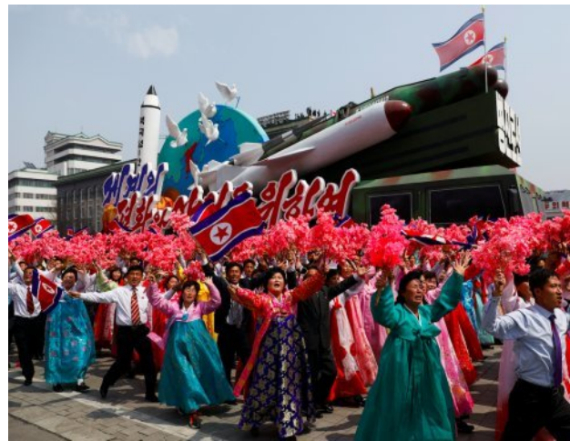
The Military Parade in Pyongyang, North Korea. April 2017

Secretary of State Rex Tillerson has declared that with regard to North Korea "the policy of strategic patience has ended. We are exploring a new range of diplomatic, security, and economic measures. All options are on the table." 49 Tillerson explained that this includes the use of force: "Certainly, we do not want to—for things to get to a military conflict. [...] If [the North Koreans] elevate the threat of their weapons program to a level that we believe requires action, that option is on the table."