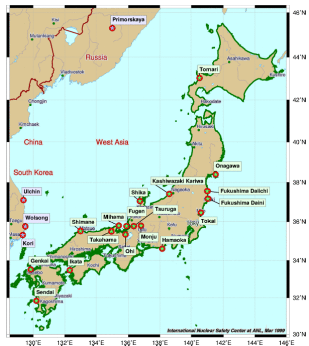
Map of Current Nuclear Power Plants

support, it quickly faded following campaigns by the government and the power companies. Despite many accidents since, their seriousness was effectively covered up by altering data records and falsifying reports to the government. Consequently, there are now 17 nuclear power stations around the earthquake-prone Japanese archipelago, comprising 54 nuclear reactors that provide 30 percent of Japan's total electricity generating capacity.