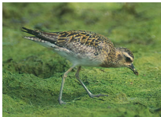
Munaguro - Pacific Golden Clover

widespread along so much of the Okinawan coast-line, it is a near miracle that such a large wetland (265 hectares), astonishingly rich in biodiversity, should have survived just adjacent to Okinawa prefecture's second largest city, Okinawa City. Awase Tidal Wetlands, typical of Japan's coral reef coastal wetlands, comprises a continuous bio-system from mud flats through sea weed and sea grass to coral reef, rich in species, including endangered and precious species such as blue mud-skipper (Tokagehaze, Scartelaos histophorus ) and Kubiremidoro (an endangered or critically endangered marine algae, Pseudodichotomosiphon constricta ). More migratory birds come here in search of food than anywhere else in Okinawa, including especially snipe and plover. 52.3 per cent of the Munaguro (Pacific Golden Plover, Pluvialis dominica ) that winter in Japan [en route between Siberia and Australia] do so at Awase tidal wetlands.