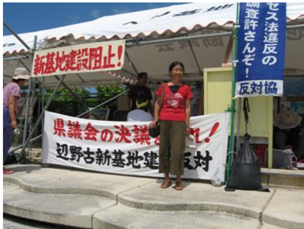
Author Urashima, October 2008

such as the Lake Toya Summit in 2008 as sensitive to green and environmental considerations, in Okinawa it proceeded with a threefold assault on some of Japan's most precious natural assets: the coral reef and the sea at Henoko in the north where it planned a major new base for the US Marine Corps, Yambaru forest, also in the north, where it planned a chain of helipads for US attack helicopters, and Okinawa City, where it would sacrifice Japan's most "rain-forest" rich marine environment in order to create something for which the court had just ruled that there was no rational purpose.