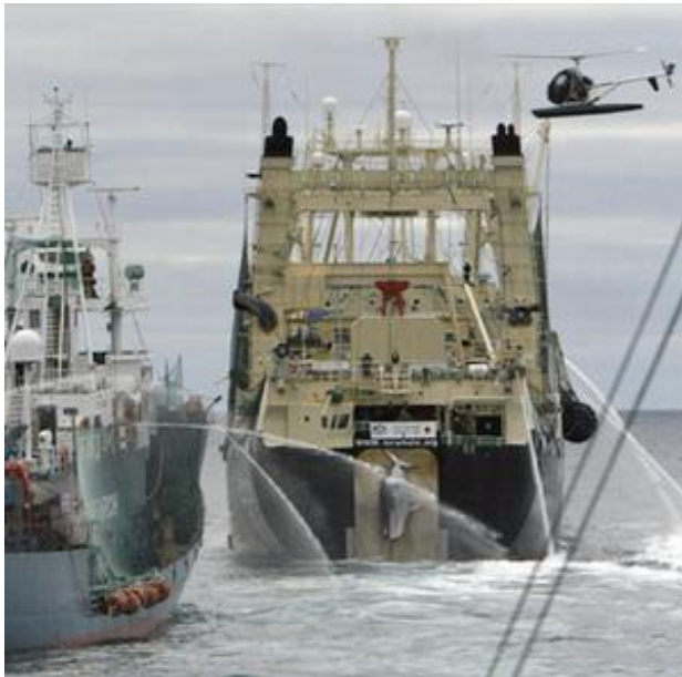
On February 6, 2009 a Japanese factory ship the Nishin Maru pulled in a Minke whale.

Under the terms of the research, the Japanese government orders the catching (and killing) of a large number of whales. This is to determine the population size, to generate more accurate statistics, and to collect earwax, which is used to determine the age of whales. But Japan's fleet mainly catches minke whales, which are common, and if the research can be done without killing whales the fleet will do so.