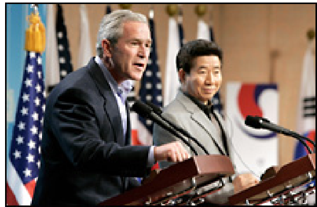
South Korean president Roh Moo-hyun and U.S. president George Bush make a joint statement in November 2005.