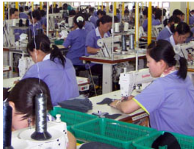
Workers in a factory at the KIC