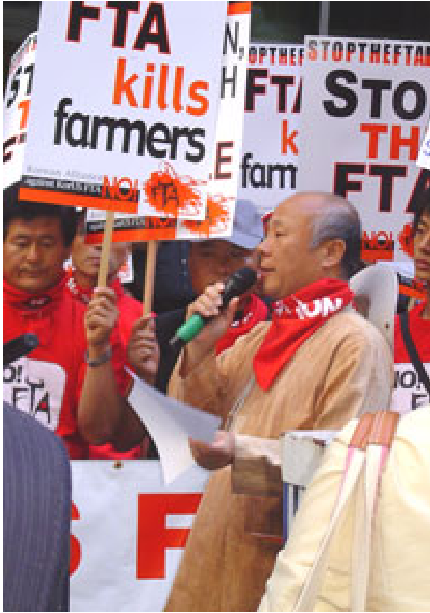
Protest outside negotiations of the U.S.-Korea FTA, Seattle, September 2006.

These labor and human rights concerns add to the considerable list of U.S. problems with North Korea, including North Korean nuclear proliferation, drug trafficking, and U.S. currency counterfeiting. These factors pose serious political impediments to extension of the FTA to products from Kaesong. The Kaesong issue could well undermine the prospects for concluding the FTA.