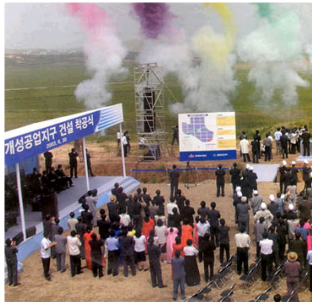
Groundbreaking ceremony for the KIC

The KIC is the centerpiece of North-South economic cooperation under the peace and prosperity policy of South Korean President Roh Moo-Hyun. At present, several dozen South Korean firms operate in the industrial park, with a total of 6,000 North Korean workers. The project is to be carried out in three stages over 10 years between 2003 and 2012. In April 2006, the Ministry of Unification of the Republic of Korea projected that the KIC would grow to over 16,000 acres, employ 700,000 North Korean workers, and have 2,000 companies at the end of 2012 (see Table 2). The U.S. officially supports the KIC. In 2004 and 2005, the U.S. approved several export controls clearances that were required by U.S. law in order for South Korean firms to bring items such as computer and telecommunications equipment to Kaesong (Manyin and Cooper, 2006, p. CRS-18).