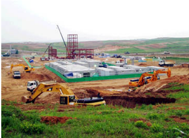
Construction of the Kaesong Industrial Complex

The SEZs are regions that guarantee the rights of foreign companies, with independent legislative, judicial, and executive branches, free from central government interference. North Korea welcomes foreign investment and trade because it generates the transfer of technology and skills; increases national employment and domestic wages; contributes to tax revenues; develops import substitute products; and helps to increase exports.