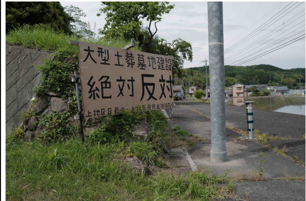
Absolute opposition against the construction of a large-scale burial cemetery.

with the Minamihata locals over multiple years, agreed to move the cemetery's location adjacent to the Trappist Monastery to a property owned by Hiji Town. Hiji Town is on the course of settling the conflict by selling the property to the BMA. In addition, the BMA has agreed to reduce the number of burial plots, limit the use of the cemetery to those who lived in the Kyushu Okinawa area, and leave twenty years between reusing the burial plots (i.e., to bury a new body in a used plot only after twenty years). The BMA has also agreed to bore holes for water quality tests. The Minamihata residents are now happy, not only because they believe their hygienic concerns were met by the above agreements (regardless of scientific grounds), but more importantly because the BMA has listened to their concerns and created a cemetery plan in dialogue with the local residents. The BMA listening to the locals and giving in to their requests is a sign of the BMA respecting the local community and implicating them in a decision that has to do with the community. The golden rule for instituting a project in Japanese rurality, from building a state-sponsored wave breaker on the coastlines in the Tohoku region (Miura, 2018) to protecting an endangered species by the Ministry of the Environment rangers (Maeda, 2009), is: one must involve the local community in deciding on what is done and how it's done. This is why the proxy system has worked for Muslim associations when accessing burial grounds.