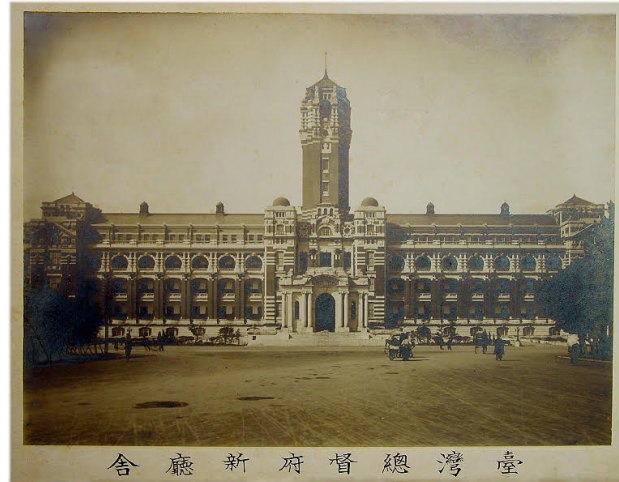
Figure 2: The Taiwan Government-General headquarters in the colonial capital of Taipei, 1919. The European Baroque-style building was over 400 feet wide with an imposing eleven-story tower in the center 200 feet long, symbolic of the Government-General's power.

Other colonies among the Western empires served as imperial gateways too, and their histories can help throw Taiwan's into further relief. For example, India, which served as Britain's entry point for the Middle East and Indian Ocean regions, possessed more institutional autonomy and greater economic and military power than Taiwan. The Indian Government-General presided over the Indian Army, the British empire's largest force, consisting of majority Indian soldiers and financed by colonial revenues. The Indian Army led incursions in the Middle East, Africa, and Asia, and the resulting acquisitions—the Straits Settlements, Aden, and Burma, among others—were placed under India's jurisdiction for several decades, until they became separate colonies supervised by the Colonial Office in London. 46 Taiwan, by contrast, never possessed its own independent army or foreign office and remained subordinate to directives issued by Tokyo's Imperial Army and Foreign Ministry in its international relations. Yet even with far less manpower and resources than both Korea and India, the Taiwan Government-General helped shape the trajectory of Japan's southern expansion through its use of overseas Taiwanese as gateway subjects.