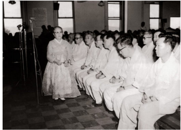
Senior officials of the Minjok Ilbo in court, 1961