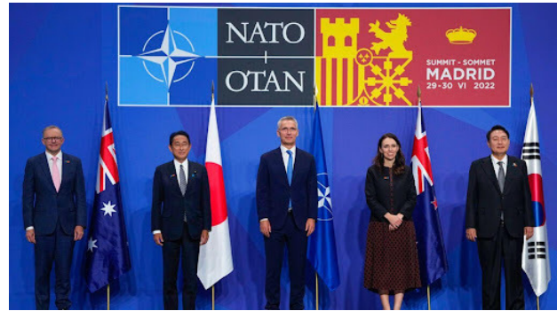
Anthony Albanese (left), the then newly elected Australian Labor prime minister joined his Japanese, South Korean and New Zealand equivalents at the 2022 NATO Madrid summit.

US alliance structures are clearly changing shape. As has often been noted this year, the Russian invasion of Ukraine has revived US dominance of NATO. Thus after two decades of Australian Defence Force high-tempo participation in NATO-aided coalition operations in Afghanistan, Iraq, and the Indian Ocean, the Australian military has become habituated to a new alliance role as an Enhanced Strategic Partner of NATO.