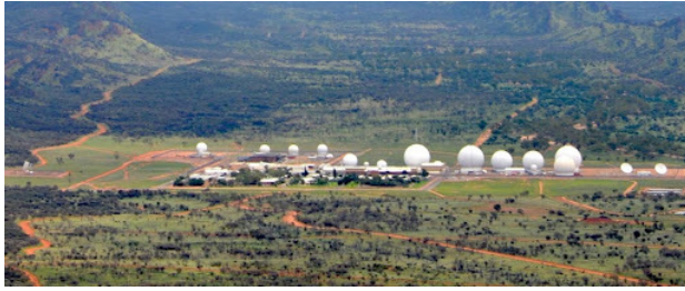
Pine Gap Satellite Surveillance Base, Australia, 2016

The fabled doctrine of the Australian government controlling the uses to which the joint facilities can be put is phrased in legal agreements as our ‘ Full Knowledge and Concurrence ’ with American operational uses of Pine Gap, all the North West Cape cluster of bases, and now RAAF Tindal and more.