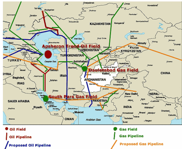
Map showing Central Asian completed and projected pipelines

All geopolitical junkies need a fix. Since the second half of the 1990s, I've been hooked on pipelines. I've crossed the Caspian in an Azeri cargo ship just to follow the $4 billion Baku-Tbilisi-Ceyhan pipeline, better known in this chess game by its acronym, BTC, through the Caucasus. (Oh, by the way, the map of Pipelineistan is chicken-scratched with acronyms, so get used to them!)