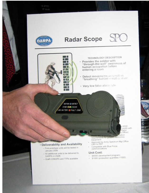
Radar Scope to sense through walls