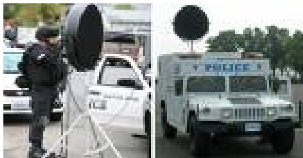
Longrange Acoustic Device