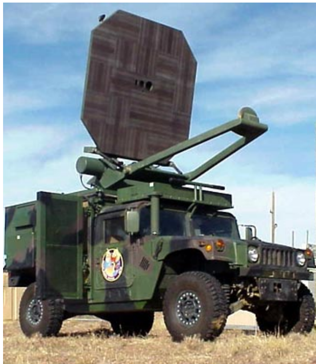
Active denial system

unleashing chemical agents and emerging technologies. Microwave-like pain rays and other directed energy weapons -- such as the Active Denial System which inflicts an intense burning sensation on victims -- were reoccurring favorites of the gathering. During their PowerPoint presentation, the men from Lite Machines, for instance, showed a computer rendering of their micro-UAVs attacking an unarmed crowd gathered in a town square with a variety of less-than-lethal weapons like disorienting laser dazzlers and chemical gases (vomiting and tear-gas agents), while a company spokesman regretfully mentioned that international regulations have made it impossible to employ such gases on the battlefield. Undoubtedly, this was a reference to the scorned Chemical Weapons Convention, which has been binding for the last decade.