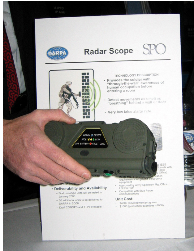
Radar Scope to sense through walls