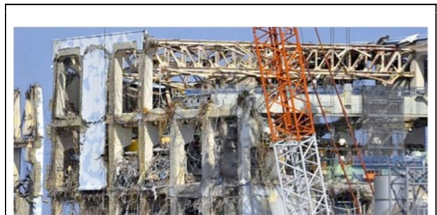
Reactor # 4 at Fukushima Daiichi

Cesium-137 at the Fukushima Daiichi site is 85 times greater than at Chernobyl.