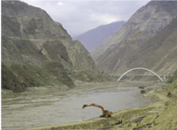
China's Xiaowan Dam, upper reaches of the Mekong in Yunnan province, is the world's tallest at 958 feet (Photograph by International Rivers).

the river clearances to aid navigation, this state of affairs will change once China has five dams in operation. And the costs exacted by the Chinese dams will be magnified if the proposed mainstream dams below China are built.