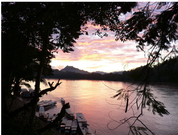
The Mekong is Southeast Asia's largest river, seen here at sunset in Luang Prabang, Laos.

Until the 1980s the Mekong River flowed freely for 4,900 kilometres from its 5,100-metre high source in Tibet to the coast of Vietnam, where it finally poured into the South China Sea. The Mekong is the world's twelfth longest river, and the eighth or tenth largest, in terms of the 475 billion cubic metres of water it discharges annually. Then and now it passes through or by China, Burma (Myanmar), Laos, Thailand, Cambodia and Vietnam. It is Southeast Asia's longest river, but 44% of its course is in China, a fact of capital importance for its ecology and the problems associated with its governance.