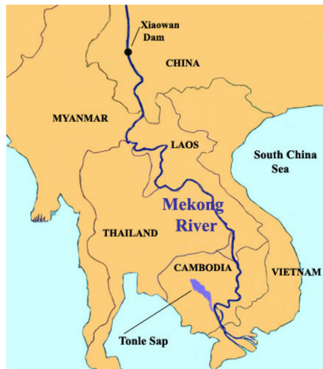
Map of the Mekong

course of the river since 1980 and up to 2004 were outlined in the Lowy Institute Paper, River at Risk: The Mekong and the Water Politics of Southeast Asia ( http://www.lowyinstitute.org/Publication.asp?id=160 ). In 2010 three hydroelectric dams are already in operation and two more very large dams are under construction and due for completion in 2012 and 2017. Plans exist for at least two further dams, and by 2030 there could be a 'cascade' of seven dams in Yunnan. Even before that date and with five dams commissioned China will be able to regulate the flow of the river, reducing the floods of the wet season and raising the level of the river during the dry. In building its dams, China has acted without consulting its downstream neighbours. Although until now the effects of the dams so far built have been limited, this is set to change within a decade, as discussed below.