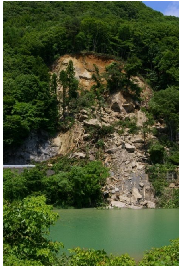
The Iwate-Miyagi Nairiku Earthquake