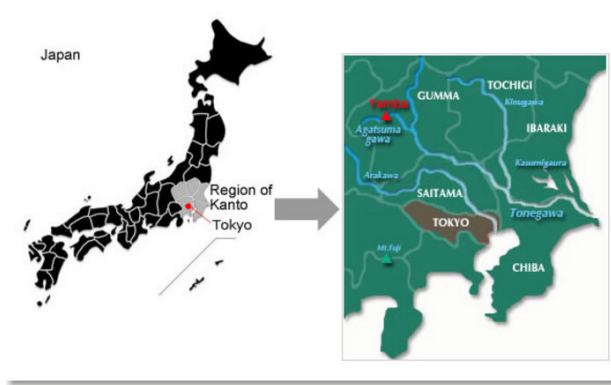
Yamba Dam map

The Transportation Ministry has designated the slopes around the reservoir site as susceptible to landslides and determined that 22 locations are likely to weaken when the reservoir is filled. In the end, however, the ministry decided to take preventive measures in just six spots “where stored water is highly likely to lead to landslides.” The region around the dam has been repeatedly subject to volcanic activity, and, as is even reported on the Transportation Ministry’s website, it is the location of a hydrothermally-altered zone. Areas that have such a zone and experience other volcanic activity are particularly vulnerable to landslides.