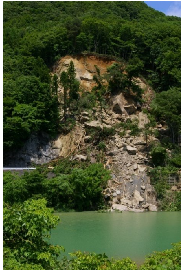
The Iwate-Miyagi Nairiku Earthquake