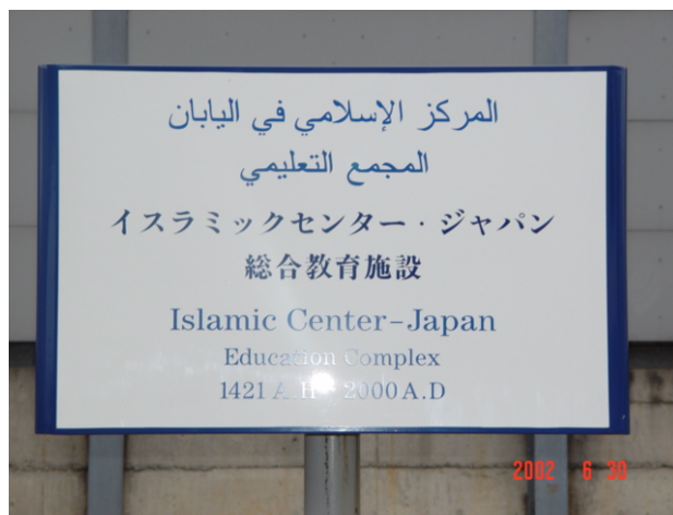
Islamic Center of Japan