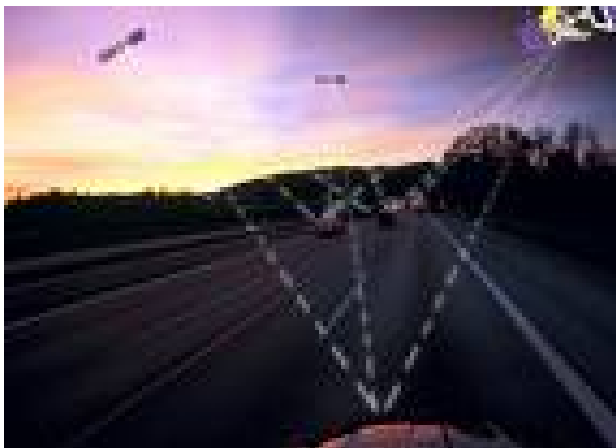
Galileo Global Navigation System

The European Union and the European Space Agency (E.S.A.) made the decision to create its own G.N.S.S. due to a combination of factors that imply political, economic, technological, social and military gains. Politically, Galileo has been portrayed as a guarantee of independence and autonomy from the U.S.-established G.P.S. This perspective became more evident in the aftermath of the Kosovo War when European forces were fully dependent on the U.S. system, a limitation that has worried the actors involved in the development of a European Security and Defense Policy (E.S.D.P.), especially the member states that stand for the modernization of autonomous E.U. military capabilities.