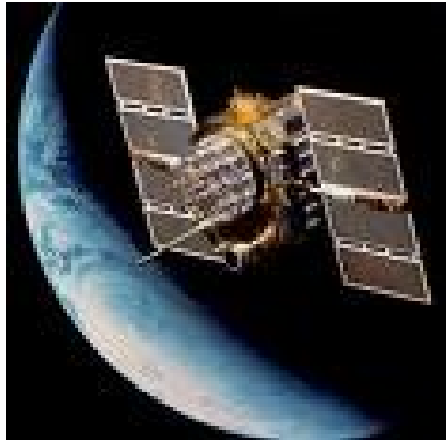
The Beidou system

of this system was already in orbit when China and the European Union agreed on the partnership. The Beidou system consisted, at the time, of three geostationary satellites, whose positioning and navigation coverage and accuracy was far behind what Galileo aimed for.