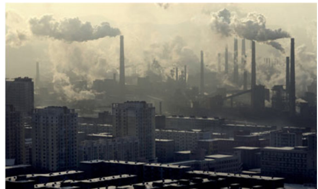
China coal-fueled steel production at Benxi

dioxide. Burning coal releases massive amounts of mercury and other pollutants into the environment. Clean coal technology in power production is not going to remove these pollutants. Theoretically of course, it is possible to develop all kinds of apparatuses to remove these pollutants from the emission stream of coal combustion. But the more one removes pollutants and particulates from the emission stream, the more costly is coal-fired power per kilowatt hour. Coal’s only strong points are that it is cheap, is already a major source of power, and there are plentiful reserves outside the OPEC countries. Raise its per kilowatt-hour cost, and it loses its main advantage to the truly clean energy sources, notably wind and solar, that are already at or close to grid parity (equivalent per kilowatt-hour generation cost) with it.