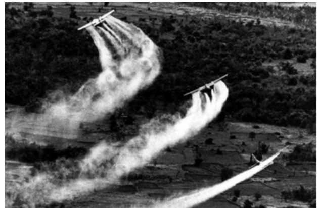
US Air Force planes spraying in densely forested area of Vietnam, 1966

The U.S. government already admits that it stored military herbicides in Thailand during the Vietnam War but it denies their presence on Okinawa. 2 At the time, Kadena Air Base (located near present-day Okinawa City) served