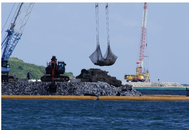
K-1 and N-5 Seawall Construction

Governor Onaga also claimed that the permit, issued under the Port and Harbor Act, pertained only to the keeping of landfill materials and the berthing of ships at the port, not to transport of landfill materials from the port by sea. He stressed that for transport by sea from the port of such landfill materials, the companies and the Okinawa Defense Bureau should have applied for a separate permit under the Land Reclamation Act, indicating that the Bureau and companies were in breach of the Act. On November 15, the same day Governor Onaga held a press conference, his administration sent a letter to the Bureau requesting it to stop transporting landfill materials by sea.