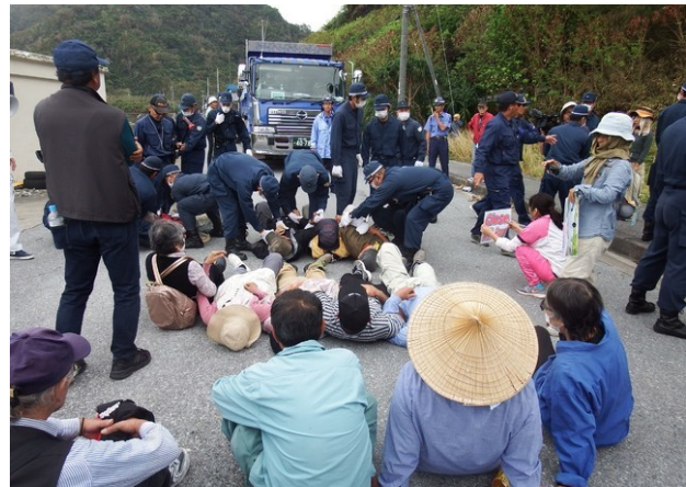
Protesters at Oku Port

On the other hand, a growing number of people feel angry and betrayed. Many now question whether Governor Onaga and his government are sincere and serious about stopping the base construction. These reactions are evident especially among protesters who are already weary from daily protests, continuing now for years, at Camp Schwab and Henoko-Oura Bay, as they now have to head off also to the distant port of Oku.