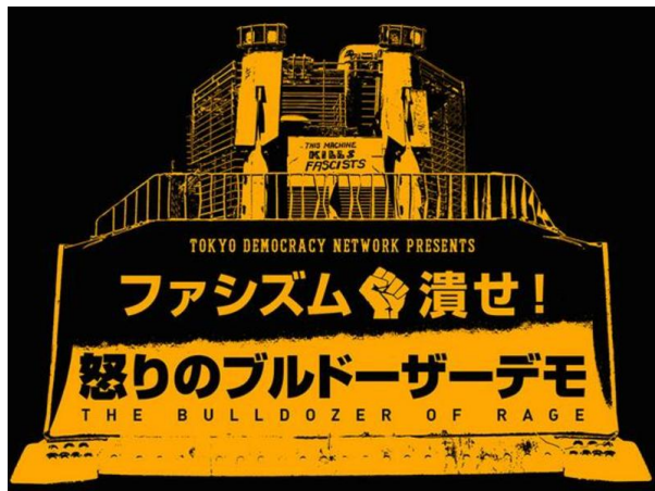
Poster, Bulldozer demonstration, Tokyo Democracy Crew

together a promotional video ( http://www.youtube.com/watch?v=Vz72dKl7jNo ) using Rage Against the Machine's "Sleep Now in the Fire" as background music.