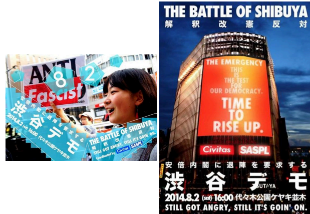
Poster for August 2 demonstration, SASPL

We can't have a society where it's uncool to say what you think or be involved in politics. . . Sometimes people say, "You're not qualified to say anything because you're a student." If you believe that, only university professors would be able to say anything . . . We think everyone can say something and should keep on doing so (SASPL, Dommune).