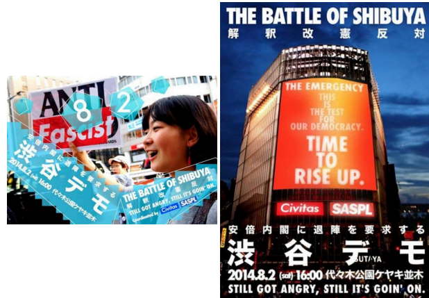
Poster for August 2 demonstration, SASPL

We can't have a society where it's uncool to say what you think or be involved in politics. . . Sometimes people say, "You're not qualified to say anything because you're a student." If you believe that, only university professors would be able to say anything . . . We think everyone can say something and should keep on doing so (SASPL, Dommune).