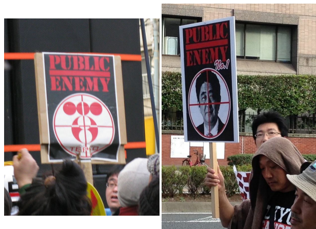
Public Enemy/ TEPCO placard, Datsu Genpatsu Sugunami antinuclear demonstration, February 19, 2012 ECD holding Public Enemy #1/ Abe placard, Bulldozer demonstration, August 2, 2014

(It's our turn to make them listen to what we say)—ECD's line from "Straight Outta 138, ( http://apjff.org/-Noriko-MANABE/3889 )" which he had reprised in the July 2012 demonstration. 6 Just as Japanese rappers paid homage to Public Enemy, Gil Scott-Heron, and others in their antinuclear raps, SASPL pays homage to socially conscious African-diasporic artists. Peter Tosh's "Get up, stand up, / Stand up for your rights" is its signature Sprechchor; Ushida quotes De La Soul's "Stakes Is High"; and the DJ plays Public Enemy's "Fight the Power" and Curtis Mayfield's "Move On Up" as background tracks. SASPL rappers also employ performance tactics that are similar to the MCAN rappers, playing to the crowds at intersections, overhead pedestrian bridges, or whenever the truck has stopped. In such circumstances, they or other students on the truck often give speeches.