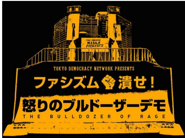
Poster, Bulldozer demonstration, Tokyo Democracy Crew

together a promotional video ( http://www.youtube.com/watch?v=Vz72dKl7j ) using Rage Against the Machine's "Sleep Now in the Fire" as background music.