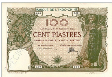
100 Piaster note, circa 1925.

Under cover of the British military campaign to suppress the Viet Minh, the French began reasserting administrative control. As one of his first moves, the new French High Commissioner in Saigon, Admiral Georges Thierry d'Argenlieu, proposed setting a high value on Indochina's currency, the piaster, to demonstrate France's resolute commitment to the colony. In December 1945, the French government pegged the rate at 17 francs to the piaster—far above its prewar value of 10 francs. 3