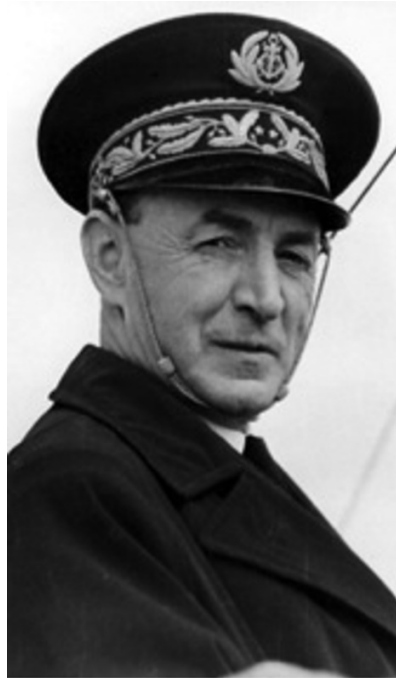
As France's High Commissioner in Indochina, Admiral d'Argenlieu supported the overvaluation of the piaster to strengthen France's ties to Indochina.

cried foul, claiming that the French had violated terms of the March 6 accord. The customs dispute, which now raised fundamental questions of political sovereignty and nationalism, triggered street fighting in Haiphong on November 20. Commissioner d'Argenlieu, who never accepted the premise of a peaceful devolution of power to the Vietnamese, had been looking for just such an opportunity to strike back against Ho Chi Minh and his supporters in the North. The French military launched a savage naval bombardment of the port, killing several thousand civilians. Military officials in Indochina suppressed news of the massacre. They also held up transmission of a telegram by Ho Chi Minh to French Premier Léon Blum proposing a peaceful compromise. Hearing nothing back from Paris, Viet Minh forces attacked the French, killing about 40 soldiers and capturing about 200. When French military forces counterattacked throughout Tonkin, there was no turning back from war. 11