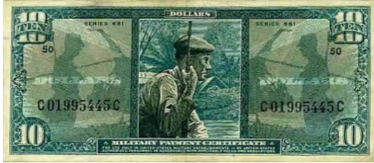
Military Payment Certificates were traded in Vietnam's currency black market.

Senior American investigators determined that the currency black market was led by a tight-knit syndicate of money changers from the Madras area of South India, with banking connections throughout the world. They worked closely with Chinese bankers in particular. 81