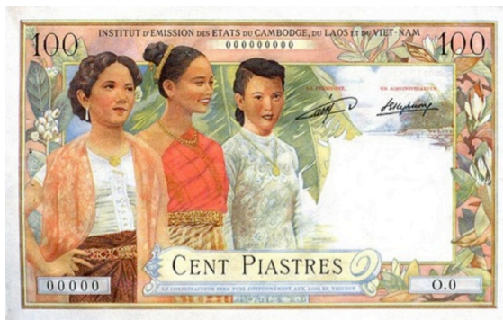
100 Piaster note, circa 1954.