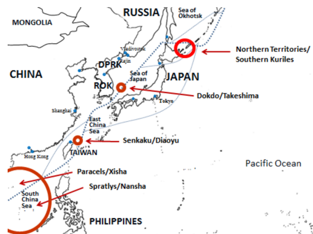
Figure 2: Major Sea Lanes Connecting the Arctic and East Asia, and the Disputed Territories

Dokdo/Takeshima, Senkaku/Diaoyu, and Spratlys and Paracels) located in the sea lanes connecting the Pacific Ocean, the Sea of Okhotsk, the Sea of Japan (East Sea), the East China Sea, and the South China Sea. This might motivate the concerned states to effectively manage and even to reach some settlement in their territorial and maritime border disputes.