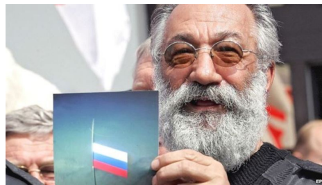
Artur Chilingarov ( http://www.rferl.org/content/Russia_To_Chart_Arctic_Claim/2043546.html ) head of Russian expedition to the Arctic-2007, shows picture of Russian flag in the seabed below the North Pole in August 2007.

approved by then Russian President Dmitry Medvedev in 2008, regards the Arctic as a strategic resource base of primary importance to Russia. Foreseeing the possible rise of tensions developing into military conflict, the document prescribes “building groupings of conventional forces in the Arctic zone capable of providing military security in different militarypolitical conditions” ( Rossiyskaya Gazeta 2009).