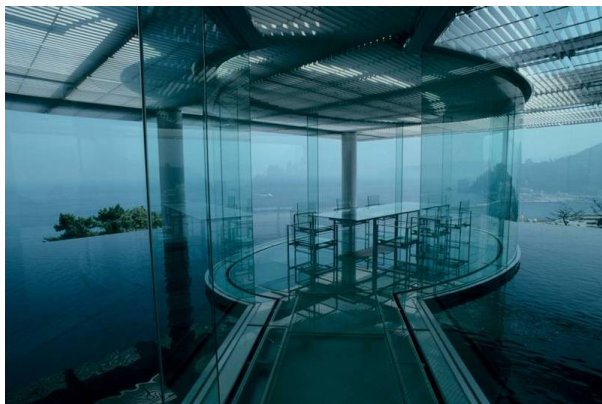
Making a connection: Kuma Kengo's 'Water/ Glass' structure in Atami, Shizuoka Prefecture, attempts to connect architecture with the sea by means of a veranda of water.

( http://www.japantimes.co.jp/author/int-roger-pulvers/ ) "I wanted to go to a place that wasn't neat and tidy, somewhere dangerous. I was bored, and it had something to do with the era and something to do with myself too."