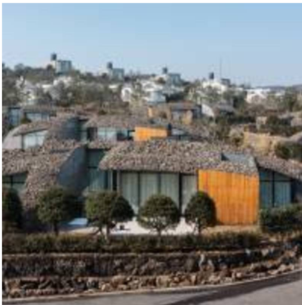
Jeju Ball Hotel

even true of some stone in his work. He laid volcanic rubble over the low sloping roofs of the buildings of the Jeju Ball hotel on South Korea's largest island of Jeju. (The island boasts more than 300 lava cones.) The roofs and the ground are linked in texture, and light from skylights scatters shadows. There is a randomness to the way the light falls and fragments. The connection here, between the natural and the artificial, is produced in the eye of the beholder.