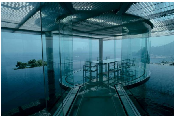
Making a connection: Kuma Kengo's 'Water/ Glass' structure in Atami, Shizuoka Prefecture, attempts to connect architecture with the sea by means of a veranda of water.