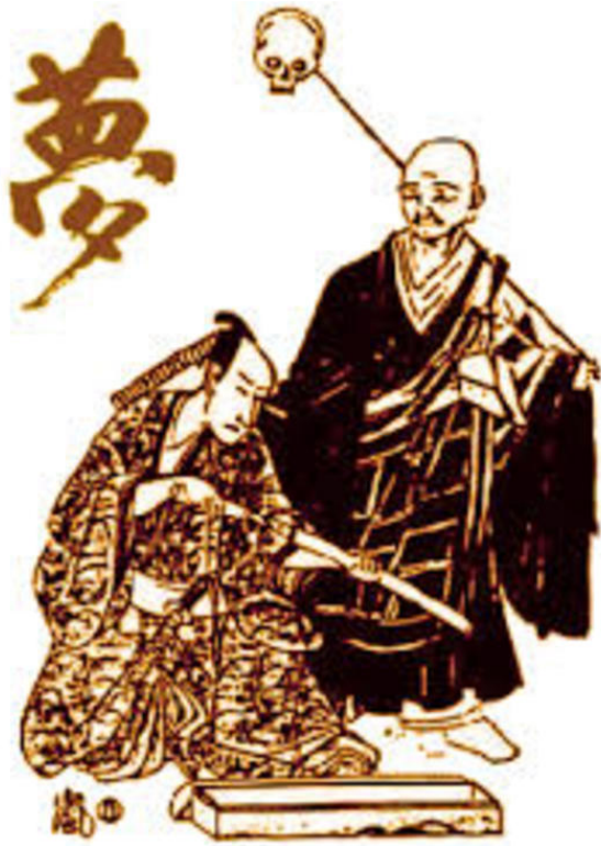
Takuan Sōhō with samurai disciple

To some extent, this is not surprising, for according to the traditional Vinaya rules governing the conduct of Buddhist clerics, even going to a battlefield was forbidden, much less intentionally killing someone on it. Thus, a Zen master on the battlefield ought to be an oxymoron. 1 Nevertheless, it is fair to say that in Japan the restrictions of the Vinaya code have, for many centuries, been honored more in the breach than in reality.