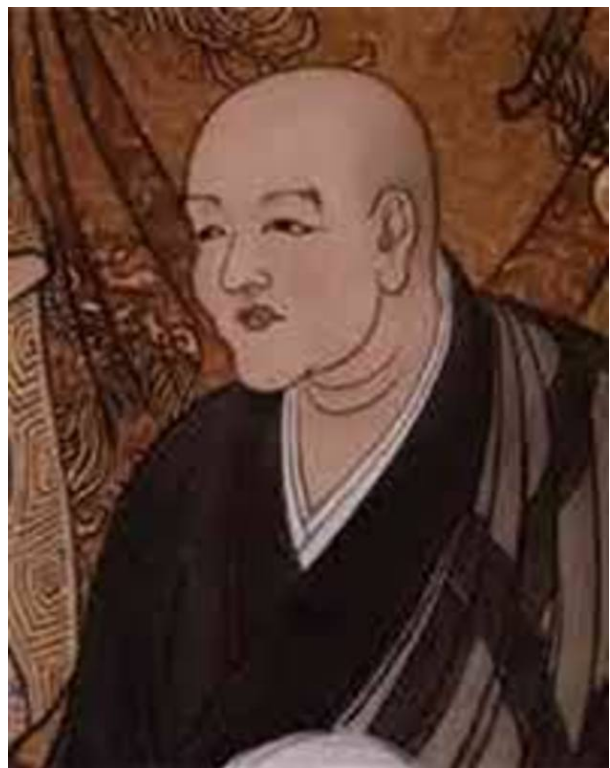
Zen Master Dōgen