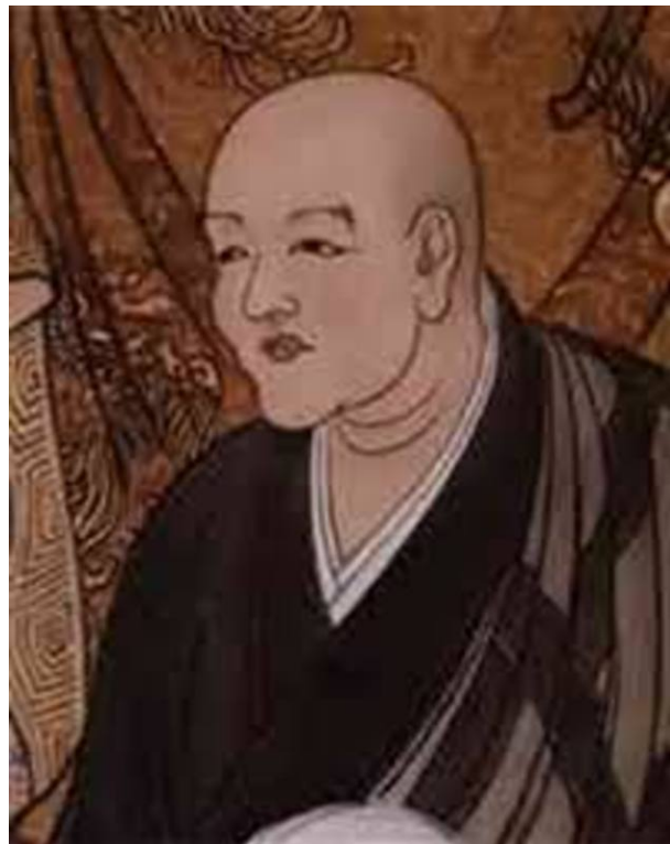
Zen Master Dōgen