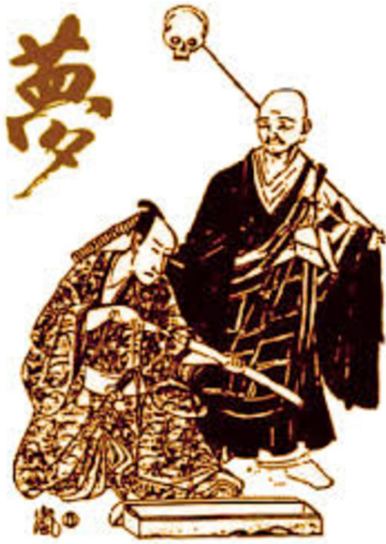
Takuan Sōhō with samurai disciple

To some extent, this is not surprising, for according to the traditional Vinaya rules governing the conduct of Buddhist clerics, even going to a battlefield was forbidden, much less intentionally killing someone on it. Thus, a Zen master on the battlefield ought to be an oxymoron. 1 Nevertheless, it is fair to say that in Japan the restrictions of the Vinaya code have, for many centuries, been honored more in the breach than in reality.