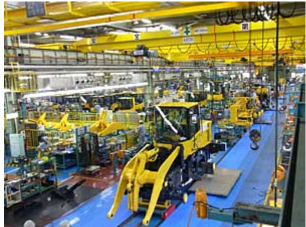
Komatsu assembly wing, Azawa

Fully 20% of the cut is from increased productivity, 32% from energy saving, and 40% from solar, biomass and other in-house generation. Komatsu is doing similar projects at other of its facilities. Komatsu's style of radical power-demand cut is core to the smart city, and Japanese projects are focused on energy, so for that reason alone the firm should be made a benchmark.