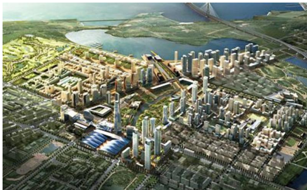
Songdo Smart City

On May 27 Ernst & Young Institute Japan (EY) released a Japanese-language study, summarizing Japan's over 200 smart city projects. EY's work is especially well timed. Among other recent developments, June 2 saw Apple join a long list of firms including Toyota Home 1 by entering the "smart home" market. 2 The global background includes thousands of smart-city projects, collectively worth at least USD 650 billion in 2014. 3 At over USD 40 billion, Korea's Songdo smart city project is the costliest private-sector real-estate development ever undertaken. 4