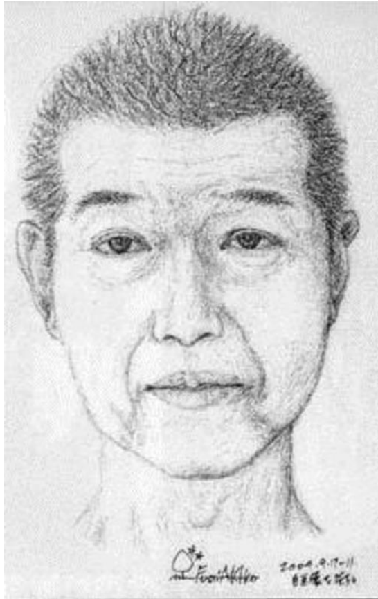
Sketch of Hoshima

The application has been rejected twice but the Hoshino Defence Committee has lodged an objection to the second rejection, and the decision on this is currently pending. The Committee is also pursuing two civil suits and requesting that all evidence be made public (in Japanese trials, prosecution evidence may be concealed), as well as demanding improved conditions in Tokushima Prison, where there is no heating or air-conditioning.