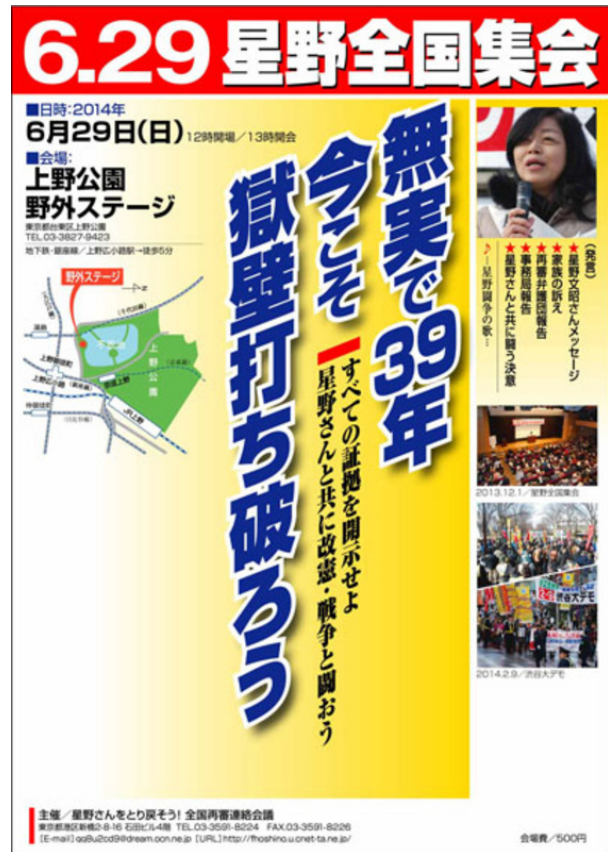
Poster for forthcoming June 29 demonstration to free Hoshino