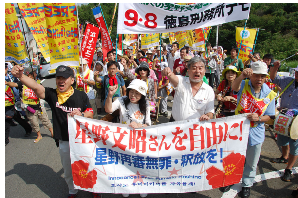
2013 Hoshino support demonstration

The groups are also undeniably social; the people