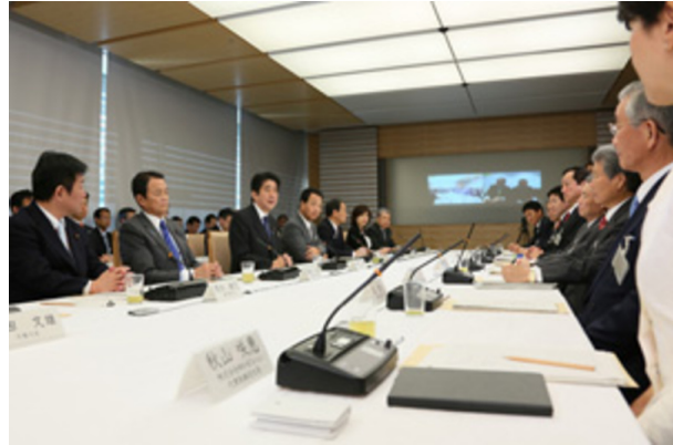
The Abe cabinet discusses growth strategy

In the early 1990s, Japan executed a managed drawdown of regular employees as firms struggled to cope with effects of the collapse of the famous asset bubble. The concurrent, sharp rise in non-regulars -- from about 10% in 1990 to about 40% of the labor force today (and more than 50% of younger workers (Morioka 2013)) -- has given rise to insecurity and anxiety. 1 Competition for good regular posts is intense; some posts, while regular, are not good, and about a fifth of non-regulars want regular employment but can't find it (MHLW 2013, 30-32). Only 41.5% of available jobs are regular positions (Mainichi Shinbun 2014). Meanwhile, regular workers may face demands for increased productivity that diminish the status advantages of regular employment. The status gap between workers in the two types of employment, however, still represents differential life chances -- time binds and work-life imbalance for better compensated regulars, and underpay and poor career possibilities for non-regulars, who get less respect and may receive less than a living wage for a nearly 40-hour workweek. The relative poverty of the working poor is linked to delays in marriage and consequent birthrate declines. This growing imbalance in (and between) the lives of regular "core" and non-regular "peripheral" workers is starting to threaten social reproduction and Japan's long-term social stability.