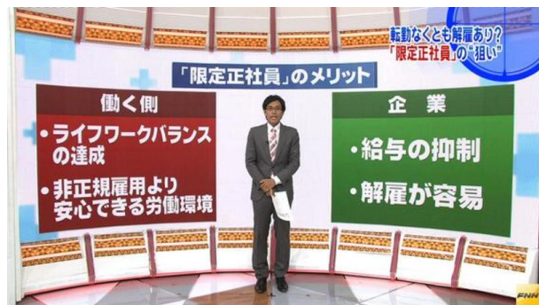
A television news show presents the conflicting aims of limited regular employment for labor and capital. For workers: achievement of work-life balance and more reliable labor environment than non-regular employment. For companies: ability to hold down wage costs and dismiss workers more easily.