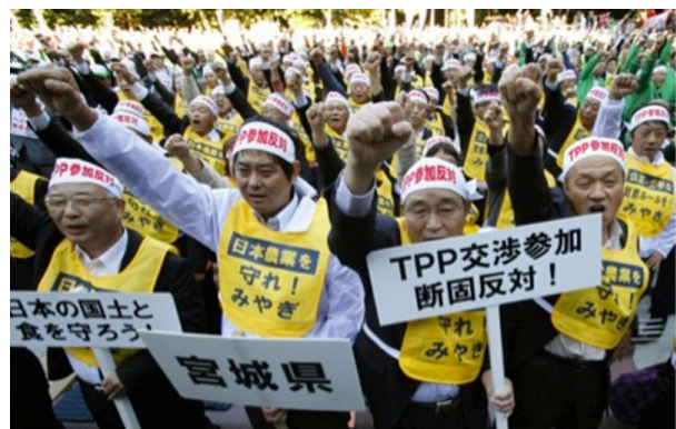
Miyagi farmers in 2011 demonstration in Tokyo: Protect Japanese agriculture

( http://www.citizen.org/trade/wto/ENVIRONMENT/ )] 5