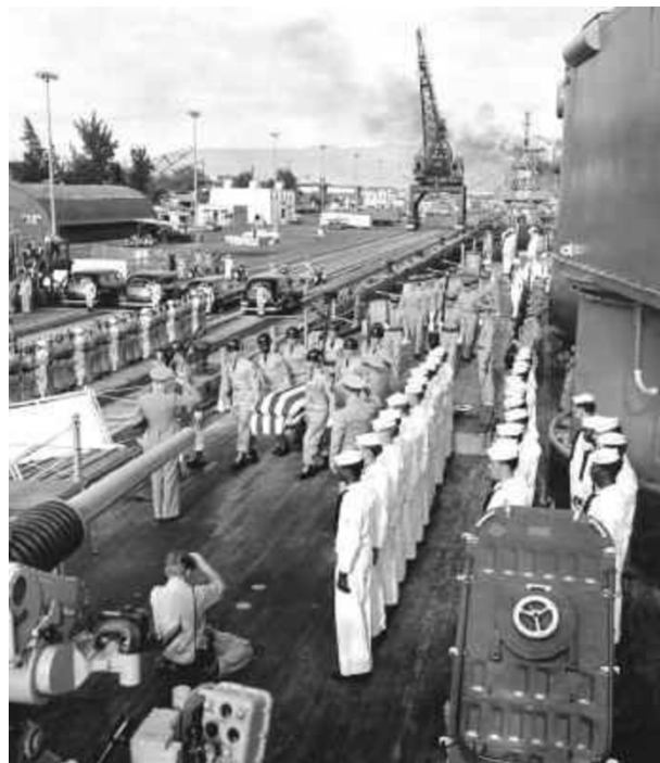
Unloading bones at Kokura

Kazurō arrived at Camp Jōno in April of that year, the bodies of some 16,000 soldiers had passed through the Jōno morgue. 26 Unlike Oë Kenzaburō's fictional student, Hanihara did not engage the dead in conversation. Instead, he observed them with an eager but detached and scientific eye, meticulously measuring bones, identifying racial characteristics and filling in the standardized diagram of a human skeleton to be completed for each body. (The instructions on the diagram read, 'black out parts of body not received'). 27