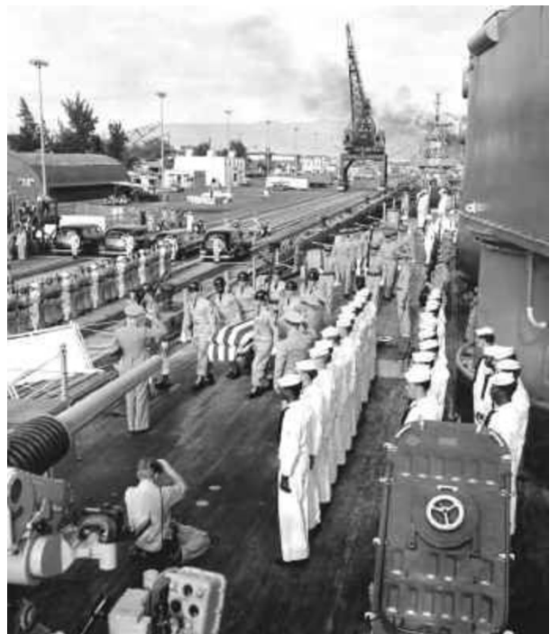
Unloading bones at Kokura

Kazurō arrived at Camp Jōno in April of that year, the bodies of some 16,000 soldiers had passed through the Jōno morgue. 26 Unlike Oë Kenzaburō's fictional student, Hanihara did not engage the dead in conversation. Instead, he observed them with an eager but detached and scientific eye, meticulously measuring bones, identifying racial characteristics and filling in the standardized diagram of a human skeleton to be completed for each body. (The instructions on the diagram read, 'black out parts of body not received'). 27