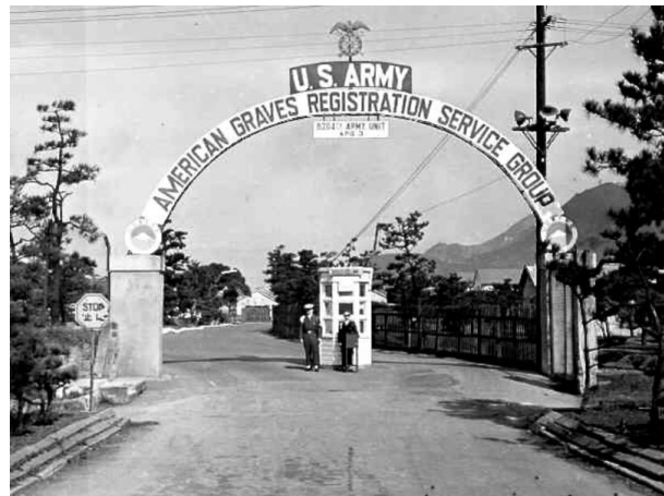
Camp Jono, Kokura, Japan

Kokura. And yet, for him, the work had benefits: it was, he felt, a unique opportunity for practical study of the physical anthropology of people of many different races. 'One thing was for sure', he wrote, 'now and probably even in the future it would be most unlikely that we would ever have another chance to examine the bones of hundreds of white people and black people'; and, as it turned out, not only of black and white, but also of Hispanics, Native Americans, Asian Americans and people of mixed race. 12