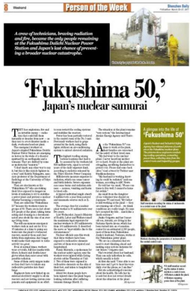
Fig. 1: The "Fukushima 50" as "nuclear samurai"

In the wake of the March 11, 2011 earthquake, tsunami, and nuclear disaster, much has been said about the character of Japan, and especially about Tōhoku and its people. In the early weeks and months, the exceptionally good behavior of an overwhelming majority of Japanese in the face of a disaster of almost unthinkable magnitude was the object of much admiration. Especially in the foreign press, mixed in with cringe-inducing references to the "Fukushima 50" as "nuclear samurai"-if anything, "kamikaze" would have been the more appropriate image-the tropes of "orderly" and "law-abiding" Japanese and "stoic" residents of Tōhoku were repeated frequently even by scholars whose careers are mostly built around combatting sloppy generalizations. Diverse voices from around the world, including those of Chinese netizens-more often cited as a bastion of virulent anti-Japanese sentiment-were joined in approbation. Sympathy and aid poured in from around the world, and the domestic media proudly relayed this news to their Japanese audiences.