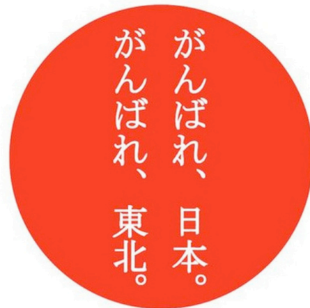
Fig. 5: This emblem, pairing "Ganbare Nippon!" ("Go Japan!") with "Ganbare Tōhoku!" is emblematic of the tendency to see 3/11 and its aftermath in national terms.

'Japanese' to describe them. Their name is not 'Japanese'... Never has the word 'Japan' been more meaningless." 28 She was wrong, of course: domestically, at least, the Japaneseness of victims has been emphasized more than their universal humanity, repeated ad infinitum and made a fundamental rationale for aiding them—as fellow Japanese and as fellow members of an economy shaken by disaster and threatened by failure to get quickly back on track. Calls of "Ganbare Nippon!" ("Go Japan!") were paired with "Ganbare Tōhoku!" as the "Japaneseness" of the tragedy was forefronted.