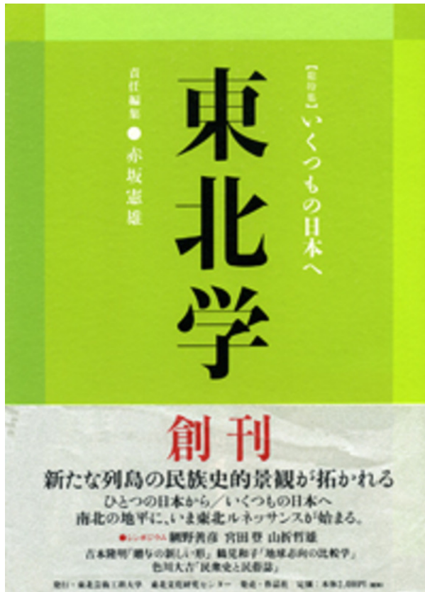
Fig. 4: The inaugural issue of Tōhokugaku (1999)