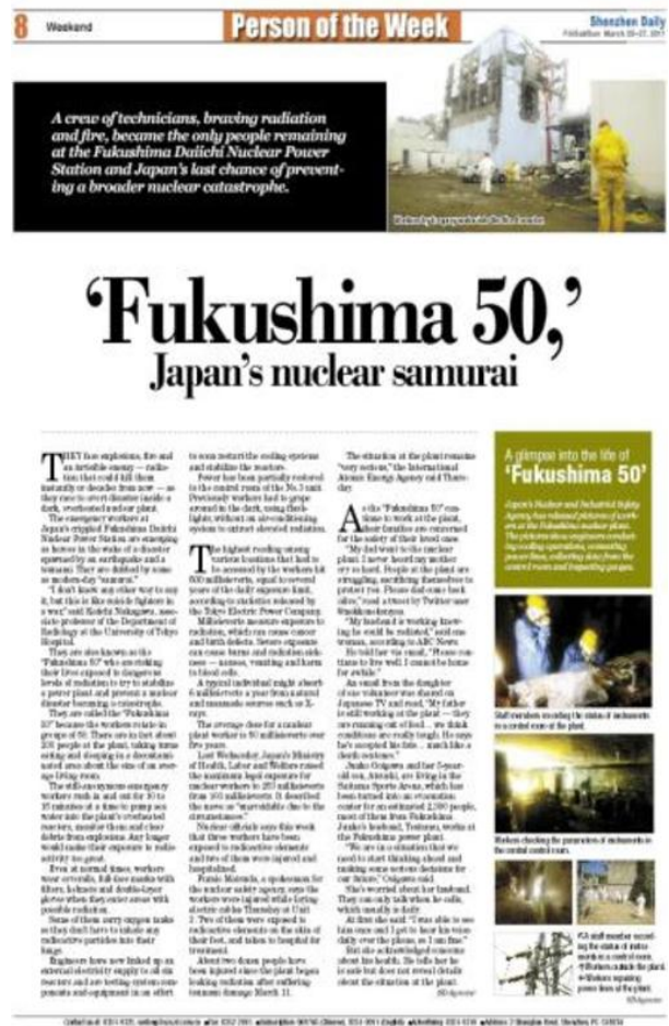
Fig. 1: The "Fukushima 50" as "nuclear samurai"

In the wake of the March 11, 2011 earthquake, tsunami, and nuclear disaster, much has been said about the character of Japan, and especially about Tōhoku and its people. In the early weeks and months, the exceptionally good behavior of an overwhelming majority of Japanese in the face of a disaster of almost unthinkable magnitude was the object of much admiration. Especially in the foreign press, mixed in with cringe-inducing references to the "Fukushima 50" as "nuclear samurai"-if anything, "kamikaze" would have been the more appropriate image-the tropes of "orderly" and "law-abiding" Japanese and "stoic" residents of Tōhoku were repeated frequently even by scholars whose careers are mostly built around combatting sloppy generalizations. Diverse voices from around the world, including those of Chinese netizens-more often cited as a bastion of virulent anti-Japanese sentiment-were joined in approbation. Sympathy and aid poured in from around the world, and the domestic media proudly relayed this news to their Japanese audiences.