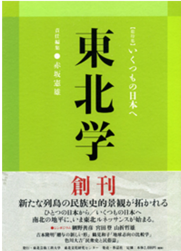
Fig. 4: The inaugural issue of Tōhokugaku (1999)