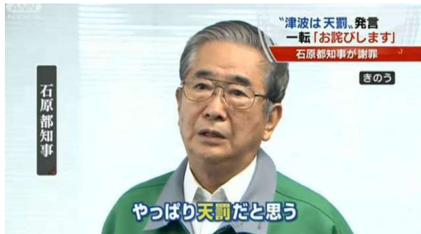
Fig. 2: Ishihara Shintarō retracting his remark that the 3/11 tsunami was "divine retribution"

year. 3 As governor of Japan's social, political, and economic capital, after 3/11 Ishihara continued to bemoan the social and moral disintegration wrought by postwar economic growth, arguing that this catastrophe was the long-awaited opportunity to escape from the postwar régime.