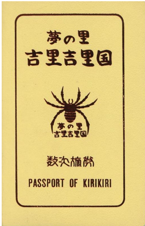
Fig. 6: "Passport" to the fictional country of Kirikiri, setting of Inoue Hisashi's Kirikirijin

Counted among the greatest works of modern Japanese satire, Inoue's dense narrative chronicles the (fictional) secession of the (fictionalized) area of southeast Iwate and northwest Miyagi prefectures hit hardest by the 2011 tsunami. The newly independent "Kirikiri" is the result of an irredentist nationalism harkening back to Tōhoku's autonomy in the twelfth century. Upon declaring its secession from Japan, the newly formed nation remodels its economy around self-sufficiency and cutting edge medical research and care, including