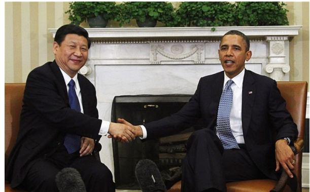
Xi Jinping with Obama, February 15, 2012

President Xi Jinping's call for a "new type of great-power relationship" in meetings in 2013 with President Obama raises important questions about the future of US-China relations. On the surface, it appeared that the two leaders were on the same page. At the June summit, Obama agreed with Xi that "working together cooperatively" and bringing US-China relations "to a new level" were sound ideas. 1 When the G-20 countries convened at St. Petersburg in September, Obama said of Xi's proposed new model: "we agreed to continue to build a new model of great power relations based on practical cooperation and constructively managing our differences." But he added that "significant differences and sources of tension" remain with China, implying that China's "playing a stable and prosperous and peaceful role" in world affairs remained a matter of US concern. 2