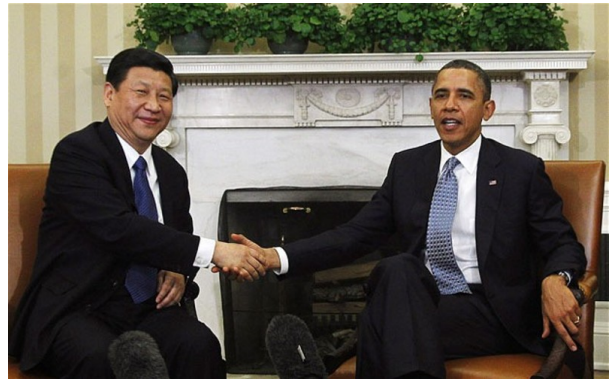
Xi Jinping with Obama, February 15, 2012

President Xi Jinping's call for a "new type of great-power relationship" in meetings in 2013 with President Obama raises important questions about the future of US-China relations. On the surface, it appeared that the two leaders were on the same page. At the June summit, Obama agreed with Xi that "working together cooperatively" and bringing US-China relations "to a new level" were sound ideas. 1 When the G-20 countries convened at St. Petersburg in September, Obama said of Xi's proposed new model: "we agreed to continue to build a new model of great power relations based on practical cooperation and constructively managing our differences." But he added that "significant differences and sources of tension" remain with China, implying that China's "playing a stable and prosperous and peaceful role" in world affairs remained a matter of US concern. 2