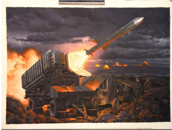
Artistic rendering of the launch of an Exocet by the ITB . 29

At the same time, however, Tokyo is reinforcing the SDF, as one of the pillars in its strategy to strengthen Japan's position in the western Pacific while striving to avoid an open conflict with East Asia. Within this pillar, the development of an amphibious capability is most significant, in particular when taken together with the entry into Japanese political discourse of references to the Falklands. Better amphibious capabilities, while necessary for military deterrence, are also connected to other aspects of Japanese foreign policy, such as humanitarian assistance. As shown recently in the Philippines, platforms such as amphibious assault ships and light carriers are very useful for rapid distribution of humanitarian aid and providing medical attention to survivors in areas with little or destroyed infrastructure and transportation networks.