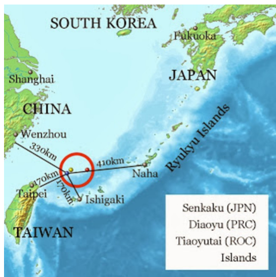
Map showing the distance between Ishigaki Island and other nearby land features . 25

Camouflaged shore-launched missiles give ships under attack a much shorter reaction time. As a result, the scope for countermeasures is considerably smaller. It is easier to detect hostile ships and planes from a distance, in comparison with a hidden mobile missile launcher, which may only reveal itself after having opened fire. While modern ships tend to be equipped with close-range air defence systems which HMS Glamorgan did not have 27 , and these may well be capable of destroying a missile in flight, the scope for doing this is small compared with missiles launched from warships and military aircraft. Furthermore, mobile launchers can provide a way out of the conundrum of how to defend a shore after losing air superiority, overcoming the disadvantage of fixed static defences, which by definition are liable to be either bypassed or destroyed by concentrated fire. We can expect Taipei to be paying close attention to Japanese moves in this area.