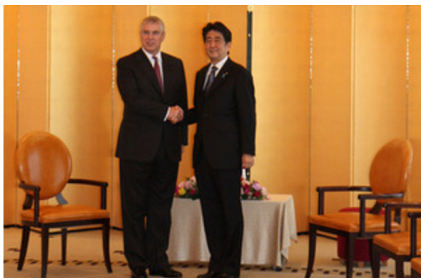
Abe's coded message to Beijing: shaking hands with Falklands veteran, His Royal Highness the Duke of York. 30

Abe Shinzo speeches. Tellingly, a two-day security conference at the Royal United Services Institute for Defence and Security (RUSI)'s Tokyo Branch in early October, featured the Duke of York, a veteran of the 1982 War, with Abe as the keynote speaker. It is interesting to note how, within the division of duties in the British Royal Family, the Duke of York is charged with export and investment promotion. So, again we find what is fast becoming Abe's trademark combination of economic and security issues. The message was dual: working to increase trade and investment links with another advanced economy, and sending the signal that, like the UK in 1982, force would be met with force. All in the most deniable way of course, but the message was there. Something similar can be said about Lady Thatcher, references to her figure and record can be seen as a coded message to Beijing, or as a mere appeal to the need to transform and quick start the Japanese economy, as the Iron Lady once did for her country.