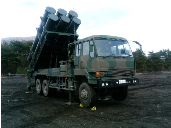
Truck carrying Type 88 missiles. Also known as SSM-1 or Shibusuta, this missile was developed by Mitsubishi Heavy Industries from the Air SDF Type 80 (ASM-1) air-to-surface anti-ship missile . 28

Conclusions . Increasing tensions in Asia make it necessary to examine the different strategies of the actors involved, Japan among them. Most observers hope that some sort of diplomatic settlement will ultimately be reached. In support of such a view they cite factors such as the economic interdependence between the different countries involved, the high costs in material and human terms of an open conflict, and the fact that public opinion indicates ambivalence concerning resort to arms against neighbors. Diplomacy and military might, however, are not two completely unrelated spheres, and a country's weight in the former usually depends to some extent on the capabilities and credibility of the latter. This is why, although rearmament and the development of new military capabilities by Japan's SDF are only one of the legs in Tokyo's strategy to deal with tensions in Asia, defending her national interest while seeking to avoid open