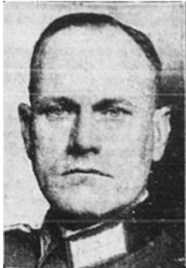
Fig. 10 - Ambassador Eugen Ott

invitation to lunch tomorrow,” 20 and on February 15, 1943: “Went to Tokyo to take lunch with Graf von Dürckheim and stayed some time with him.” 21