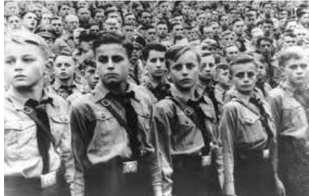
Fig. 5 - Hitlerjugend

It is for this reason that the Nazis fiercely attack Soviet Russia. They claim that the core of the Communist Party, beginning with Stalin himself, is composed of either Jews themselves or their relatives who have some connection to them and that, since people like these are up to no good, one of the great missions of the German people is to crush Soviet Russia. The speeches given by the leaders at the recent Nazi rally in Nuremburg, among others, were very extreme. They directly attacked the Soviet Union as their great enemy of the moment. They said as much as could be said in words, completely ignoring diplomatic niceties and attacking them viciously. From looking at the newspapers, you can get a good sense of their truly fierce determination. People are saying that if, in the past, the leaders of one country had done something like this it is inevitable that within twenty-four hours the other country would have declared war. In any event, the Nazis' determination is deadly serious!