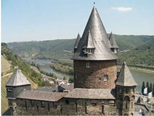
Fig. 6 - Stahleck Castle

in no way approve. While it is true that Nazis and Fascists also insist on totalitarianism, in one sense it can be said that theirs is a form of resistance to Communist actions. Or it can also be understood as turning the Communists' methods to their own advantage.