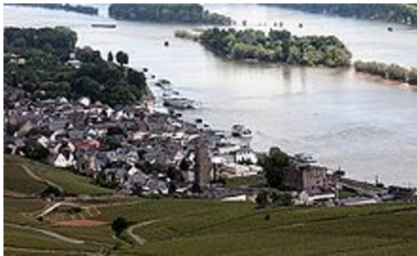
Fig. 3 - Rüdeshheim am Rhein

Be that as it may, Suzuki went to England in 1936 where he delivered a set of lectures that he would publish as his famous Zen Buddhism and Its Influence on Japanese Culture in 1938 (republished in the postwar era as Zen and Japanese Culture ). Following the conclusion of his lecture tour in England, he went to Paris to conduct bibliographical research, and then on to visit some distant relatives living at the time in Rüdeshheim am Rhein, a small village on the Rhine River west of Wiesbaden.