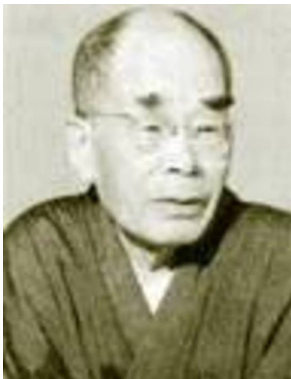
Fig. 1 - D.T. Suzuki