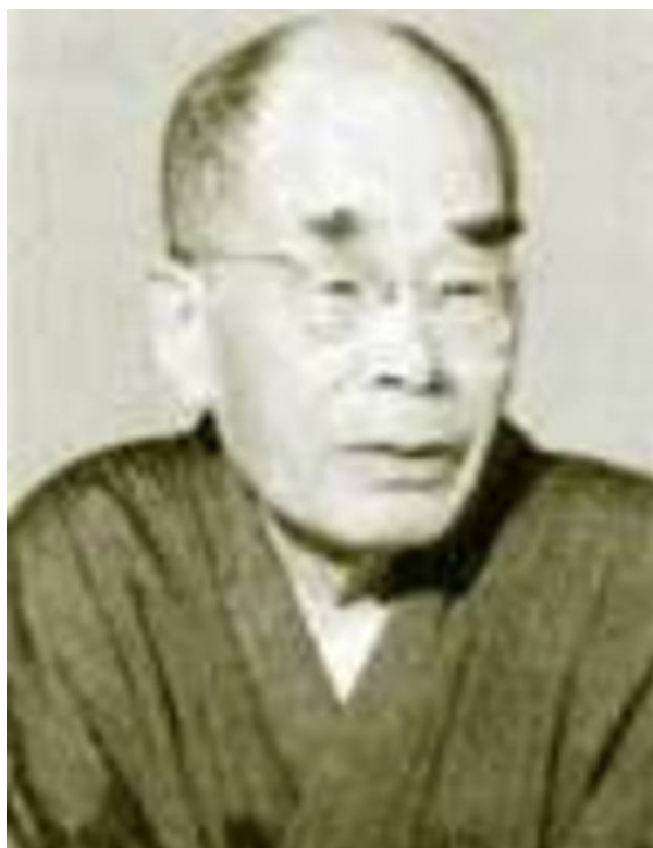
Fig. 1 - D.T. Suzuki