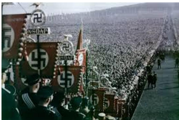
Fig. 4 - 1936 Nazi Rally in Nuremberg

On occasion, in England, too, I have encountered Jews. I recently met a young self-professed wealthy poet who had been persecuted and expelled from Germany. After listening to his story, I felt sorry for him because he suddenly found himself living in poverty in a foreign land. As regards individuals, this is truly a regrettable situation.