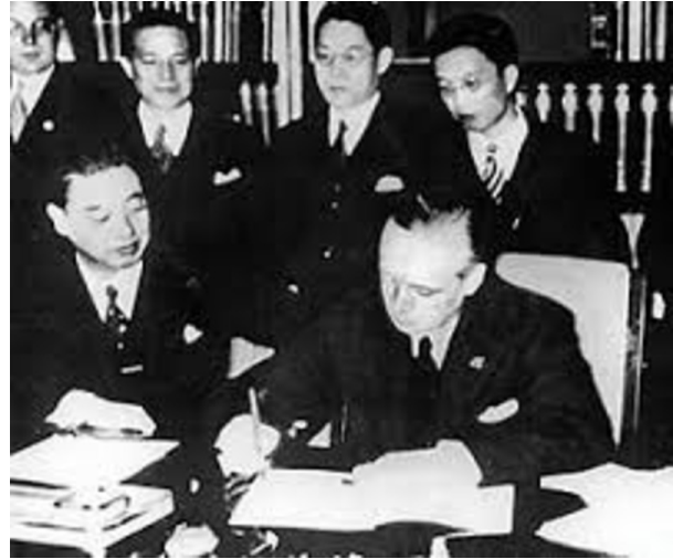
Fig. 7 - Signing of Anti-Comintern Pact

In short, the societal context within which a piece is written, coupled with the writer’s personal background, are important and often neglected methods for determining the meaning of a text. In Suzuki’s case, the question is not only the meaning he himself meant to convey, but also, what the editors of a major Buddhist newspaper would have allowed him to say in October 1936. As Sueki Fumihiko, one of Japan’s leading historians of modern Japanese Buddhism, points out: “When we frankly accept Suzuki’s words at face value, we must also consider how, in the midst of the situation as it was then, his words would have been understood.” 6 In other words, what would Suzuki’s readers have thought he meant?