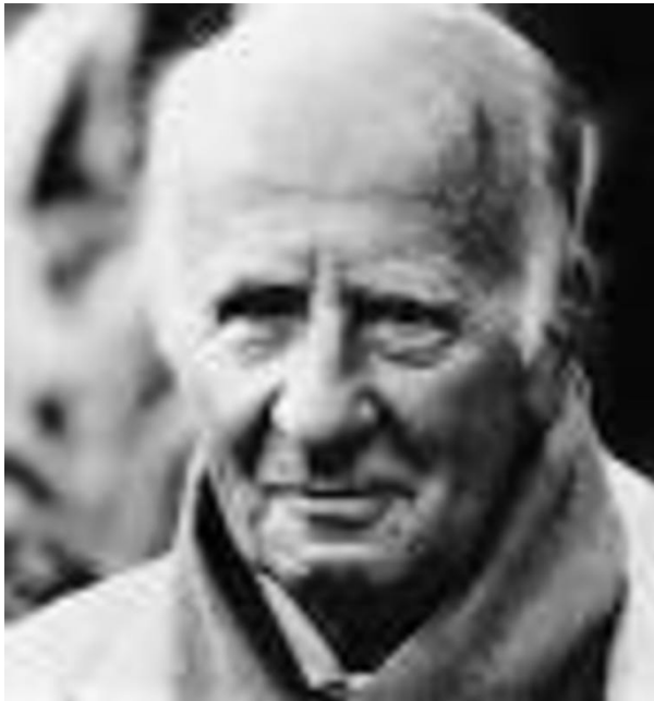
Fig. 2 - Graf Dürckheim

While I hadn't paid much attention to this passage when I first read it, now it brought a flood of questions to mind, first and foremost who was Graf [Count] Dürckheim (1896-1988)? And why was Dürckheim imprisoned as a suspected war criminal? Further, why had a suspected German war criminal been studying with D.T. Suzuki during the war years?