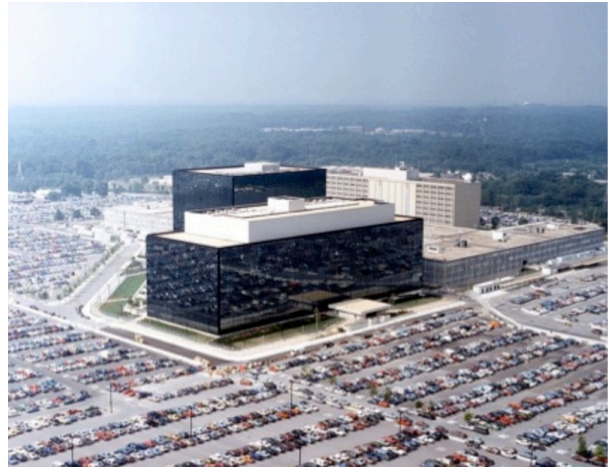
National Security Agency Headquarters, Fort Meade, Md

report of the U.S. Director of National Intelligence, more than four million people hold a security clearance that enables them to view classified information. 20 Among them, an astounding 1.4 million hold the "Top Secret" clearance, just like Manning and Snowden did.