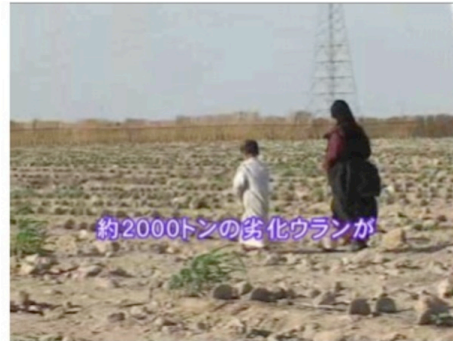
‘Approximately 2000 tonnes of DU’ - screenshot from Kamanaka Hitomi (dir.), ‘Hibakusha: Sekai no owari ni’ (Group Gendai Films, 2003)

solid uranium (4,500 grams), which dispersed 300 and 500 tonnes respectively of powdered DU into the local fields and water-ways. 35