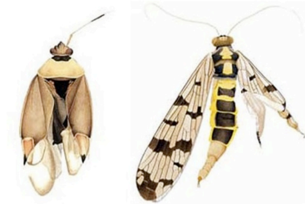
Left: Soft bug (Miridae) from Gösgen, Switzerland ; Right: Scorpion fly (Panorpis Communis) from Reuenthal, Switzerland