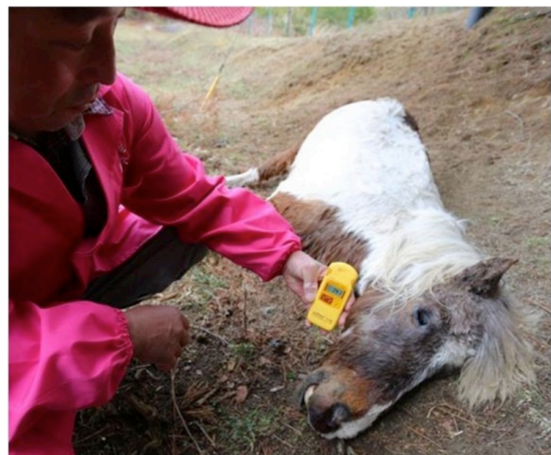
A dead horse at the Hosokawa ranch, 2013

red blood cell production). Fieldmice in their 52nd generation since the disaster sampled in early 2012 from a forest 30 km from the NPP1 (Kawauchi-mura forest, Ibaraki-ken) still showed genetic mutations 100 times the control and very high Cs137 levels (3100 bq), as did earthworms, leaves and soil from the same area. 52 People are still growing rice in these areas, and are also returning to them. In early July 2013, moss on the roof of a building in Fukushima city 50kms from the NPP returned extremely high Cs137 concentration (1,785,216 Bq/Kg). 53