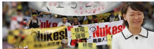
Akie Abe Supports Anti-Nuclear Movement

58.3% of Japanese do not support the export of Japan's nuclear technologies and expertise while 24% are in favor. Even within the LDP, opponents (43.2) exceed supporters (40.4) of nuclear exports. (Japan Times 6/13/2013) The export sales drive is being ramped up even as 150,000 people remain displaced from their houses due to the Fukushima accident. Abe faces further opposition to his nuclear energy plans on the domestic front as his wife also opposes nuclear exports. She said, "It will be better to use part of the money spent on nuclear plants for the development of new energy and promote the sale of Japanese-born clean energy overseas." (Asahi June 11, 2013)