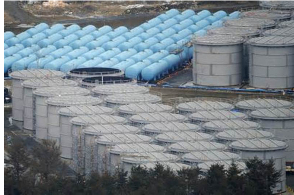
Fukushima Daichi site now covered with tanks for storing radioactive water

Tepco has adopted various strategies to store the flood of highly contaminated water and none have worked, and has only belatedly acknowledged that it is overwhelmed by the problem. (Asahi 8/3/2013; 7/23/2013) Contamination remains high because cracks in the reactor buildings and basements remain unrepaired. These areas are dangerous to access because radiation levels remain very high.