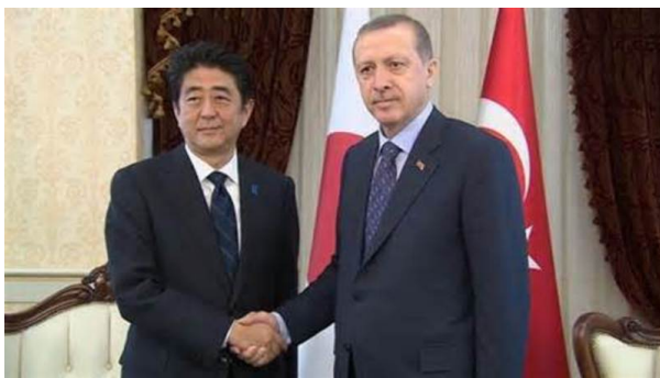
PM Abe Clinches $22 bn Nuclear Deal with Turkish PM Erdogan

meaning that Japanese firms are major players in nuclear energy. Abe has become an active pitchman for Japanese nuclear technology, but if Japan begins phasing out its nuclear reactors, potential clients might look elsewhere. Abe's growth strategy calls for tripling infrastructure-oriented exports to $300 bn by 2020, and nuclear technology exports are key to achieving this target. Earlier this year Japan (with French companies) secured a long-term $22 billion contract with Turkey (a quake prone country). It has also signed a nuclear technology agreement with the United Arab Emirates and is eyeing sales to Brazil and Saudi Arabia. Negotiations are also ongoing with India to enable Japan to sell its technology there and Abe lobbied hard on behalf of Japan's nuclear exporters at a June 2013 central European summit of the Visegrad countries (the Czech Republic, Hungary, Poland and Slovakia) He also signed an agreement with France in June 2013 to deepen cooperation on nuclear exports. (The Diplomat 7/3/2013)