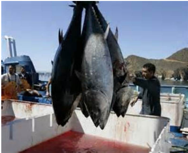
Fukushima's fishermen wonder if they will ever be able to resume their livelihood

substances. (Asahi 7/25/2013) Local fishery associations oppose the releases and remain skeptical about assurances that the processed wastewater is safe. They also worry about how these revelations about contaminated groundwater pouring into the ocean will sabotage their efforts to regain consumer trust.