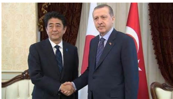
PM Abe Clinches $22 bn Nuclear Deal with Turkish PM Erdogan

meaning that Japanese firms are major players in nuclear energy. Abe has become an active pitchman for Japanese nuclear technology, but if Japan begins phasing out its nuclear reactors, potential clients might look elsewhere. Abe's growth strategy calls for tripling infrastructure-oriented exports to $300 bn by 2020, and nuclear technology exports are key to achieving this target. Earlier this year Japan (with French companies) secured a long-term $22 billion contract with Turkey (a quake prone country). It has also signed a nuclear technology agreement with the United Arab Emirates and is eyeing sales to Brazil and Saudi Arabia. Negotiations are also ongoing with India to enable Japan to sell its technology there and Abe lobbied hard on behalf of Japan's nuclear exporters at a June 2013 central European summit of the Visegrad countries (the Czech Republic, Hungary, Poland and Slovakia) He also signed an agreement with France in June 2013 to deepen cooperation on nuclear exports. (The Diplomat 7/3/2013)