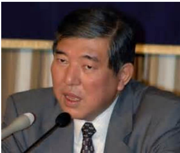
Ishiba Shigeru, LDP Secretary General, wants to keep the nuclear bomb option open

fleet of 50 reactors, Ishiba says, "Having nuclear plants shows to other nations that Japan can make nuclear weapons." (AP 7/31/2012) He added, that Japan has no plans to make nuclear weapons but believes that it is crucial for Japan to maintain that option. Given its advanced level of technology and prototype inter-continental ballistic missile, Gavan McCormack points out that, "No country could match Japan as a potential member of the nuclear weapon club." (McCormack 2007) He adds, "Protected and privileged within the American embrace, it has evolved into a nuclear-cycle country and plutonium super-power."