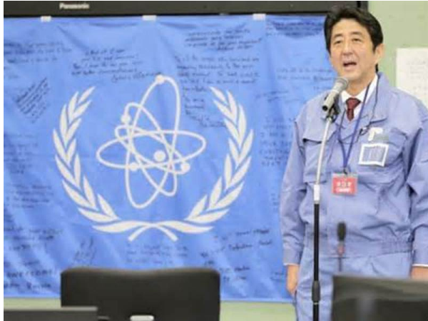
PM Abe talking to Tepco employees