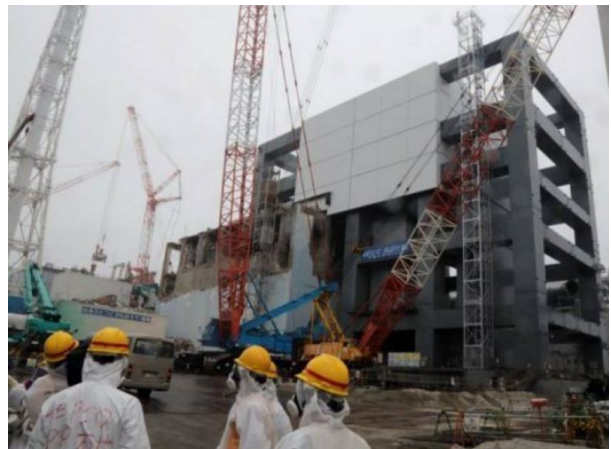
Reporters and Tokyo Electric Power Co workers during a tour of the Fukushima nuclear plant on June 12, 2013

Japan's ruined and radioactive reactor plant at Fukushima Daiichi has been an abiding source of concern among knowledgeable observers. There are a host of good reasons for this reemergence. As this Mainichi survey observes ( http://mainichi.jp/english/english/newsselect/news/20130808p2g00m0dm037000c.html ), it is now clear that several hundred tons of radiation-contaminated water is entering the ocean per day. Over the past week, it suddenly returned as an intense focus of concern in the Japanese 1 and quality overseas press. 2 There are a host of good reasons for this reemergence. As this useful summary ( http://www.washingtonsblog.com/2013/08/official-tepco-plan-could-cause-fukushima-reactor-buildings-to-topple.html ) of articles and expert statements reveals, it is now clear that several hundred tons of radiation-contaminated water is entering the ocean.