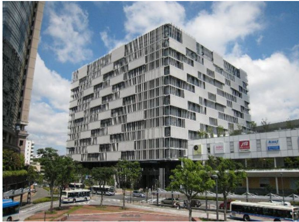
Toshiba's Lazona Kawasaki Toshiba building

begin testing this BEMS in the vicinity of Kawasaki station.