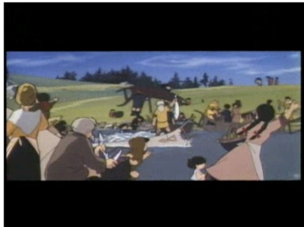
Celebrating the first catch in Horus' village

driven out of their natural habitat by development and eventually surrendering in human form to workaholism and long commutes, but managing to hold onto an "outside", recreating on an empty golf course the raucous carnivals they celebrated freely before the coming of the bankers and the bulldozers.