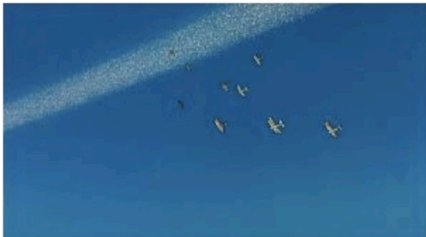
Porco's friends rise to join the countless dead

friends and foes alike ascended in silence, drifting in their planes. Far above is another cloud made up of the countless planes of the pilots who died in that war, maybe in all wars to come as well. Was it heaven in that cloud, or was it hell, the film asks? Horikoshi and Caproni pose a similar question. There is no answer. Caproni is clear, however, that the Zero was not destroyed alongside Japan but that it was the Zero that destroyed Japan. Nahoko's spirit implores Horikoshi to live and he walks off into the future, which of course is our future, a time in which the airplane has by no means been freed from the curse of warfare.