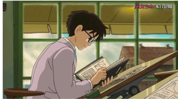
Horikoshi throwing himself into work

charged along his dream path, a line that essentially paralleled Japan's descent toward war and the destruction of self and others.