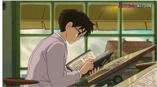
Horikoshi throwing himself into work

charged along his dream path, a line that essentially paralleled Japan's descent toward war and the destruction of self and others.