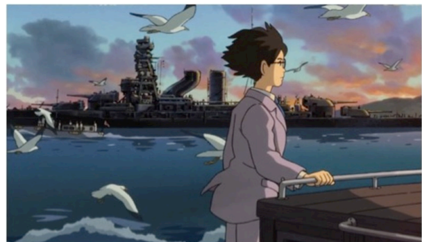
Horikoshi testing carrier fighters for the Imperial Japanese Navy

Horikoshi met briefly in Germany, has fallen afoul of “the government”. “Do you mean Mr. Hitler’s government?”, a somewhat confused Horikoshi asks. Castorp adds that Junkers will be “annihilated” and in reality, the German airplane pioneer died under house arrest after fighting unsuccessfully to keep his technology out of Nazi hands. The contrast between Junkers and Horikoshi, as well as the lack of easy choices as industry and invention are increasingly indivisible from totalitarian militarism, become evident as the story develops. Like his earlier vision of Caproni’s bomber, however, these are prophecies that haunt Horikoshi, but ones that he does not heed. It is notable that in the short manga about the development of the Zero which ran in Model Graphic magazine in 2009 and 2010 and led to Studio Ghibli’s decision to take up the Kaze Tachinu film project, Miyazaki depicts Horikoshi and the other designers as pigs – his visual shorthand for people who are selfish and myopic, having given up on working for the public good. 1