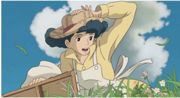
Nahoko at Karuizawa

reunion with Nahoko. The pair confess their love after a short courtship. Nahoko, however, has advanced tuberculosis. They marry despite the knowledge that she will not likely survive.