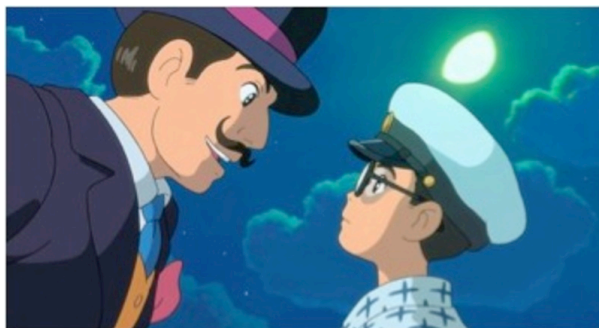
Horikoshi and Caproni

At school, the young Horikoshi borrows an English airplane magazine from a teacher. The volume tells the story of Caproni, an eccentric Italian airplane designer who becomes the boy's idol and advisor through a series of dream dialogues, exhorting Horikoshi to give his all to airplane design. Caproni's story reflects Horikoshi's eventual path – the Italian built bombers during World War I, while dreaming of constructing a massive trans-Atlantic plane in peacetime. The tragedy of engineers who married their design ambitions to military production is at the heart of Kaze Tachinu