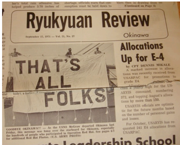
The banner hung on the stern of the final Operation Red Hat ship to leave Okinawa.