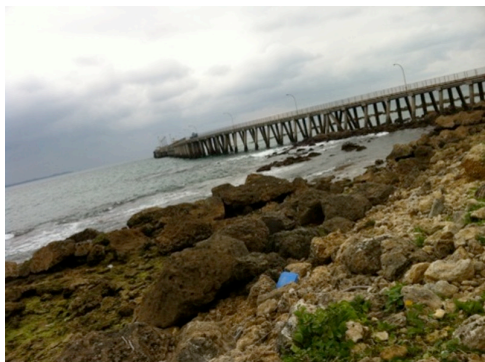
Windswept Ten Gan pier as it looks today – the staging post for the alleged Okinawa sea dump of chemical weapons.