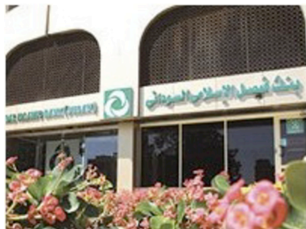
Faisal Islamic Bank of Sudan

The Al Shamal bank does acknowledge that among its five “main founders” and principal shareholders is another Khartoum bank, the Faisal Islamic Bank of Sudan. According to public records, 19 percent of the Faisal Islamic Bank is owned by the Dar Al-Maal Al-Islami Trust, headed by Saudi Prince [Mohammed al-Faisal] al-Saud.