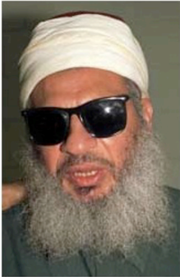
Sheik Omar Abdel Rahman

conspired to kill Meir Kahane, the founder of the Jewish Defense League.