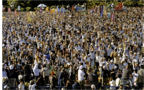
The September 2007 rally

to learn afresh the history of that period, as evidenced in the participation of more than 110,000 individuals in the ‘Prefectural Citizens’ Rally Demanding the Retraction of the Assessment Pertaining to Textbook Authorization’, 5 held on September 29, 2007 in protest of the decision to delete from secondary-level Japanese history textbooks an entry stating that the so-called ‘mass suicides’ of Okinawan civilians that occurred during the Battle of Okinawa were actually the result of coercion by Japanese forces. Through meticulous investigation, scholars of the Battle of Okinawa have proven the presence of ‘comfort women’ within the 32 nd Army Headquarters Trenches, as well as the reality of the massacre of Okinawan civilians in the vicinity of the trenches. And yet, the Prefectural authorities unilaterally deleted all mention of these historical facts from the historical marker’s explanatory text, an act that was due solely to the intervention of external interests who objected to their inclusion, claiming that no official documents referring to these facts had been found. The Prefectural government was itself involved in the Prefectural Citizens’ Rally of September 2007. Given its recent handling of the historical marker issue, however, one cannot but feel uneasy over how the issue of the relocation of the U.S. forces to Henoko will pan out.