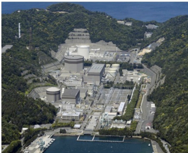
Fault under the Tsuruga reactor

the above argument. First, Japan does not have 50 reactors ready and waiting to be restarted. Fully six of its nuclear plants (meaning sites with multiple reactors) are under investigation because there is concern that lax regulation saw them built on or too close to active seismic faults. The most recent example is the Tsuruga number 2 reactor in Fukui Prefecture. The previous and now defunct regulator (the Nuclear and Industrial Safety Agency of the METI) assented to its construction after a “shoddy” safety check, but on May 22 the new regulator (the “Nuclear Regulatory Agency,” or NRA) accepted the advice of its five-member expert panel and ruled that the plant is built on an active seismic fault. 2